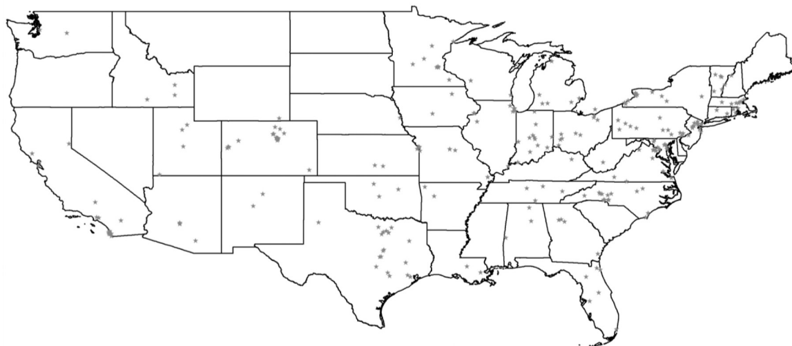
Figure 2. Locations of Respondents (n = 268). Note: A total of 193 participants have missing locations.

49.0%) participated in only 1 survey and 7 (1.5%) participated in all 12 (Figure 1). Figure 2 shows the location of 268 respondents (193 have missing locations). The majority (n = 312; 67.7%) of the respondents were from family medicine, 20 (4.3%) were from an “other” specialty, 8 (1.7%) were from behavioral health, 7 (1.5%) were from general internal medicine, 4 (0.9%) were from emergency medicine, and 1 (0.2%) was from dental. In total, 109 (23.6%) were missing a specialty (Table 1). The respondents came from a variety of practice types including primary care only (n = 132; 28.6%) and multi-specialty groups (n = 34; 7.4%; Table 1). The