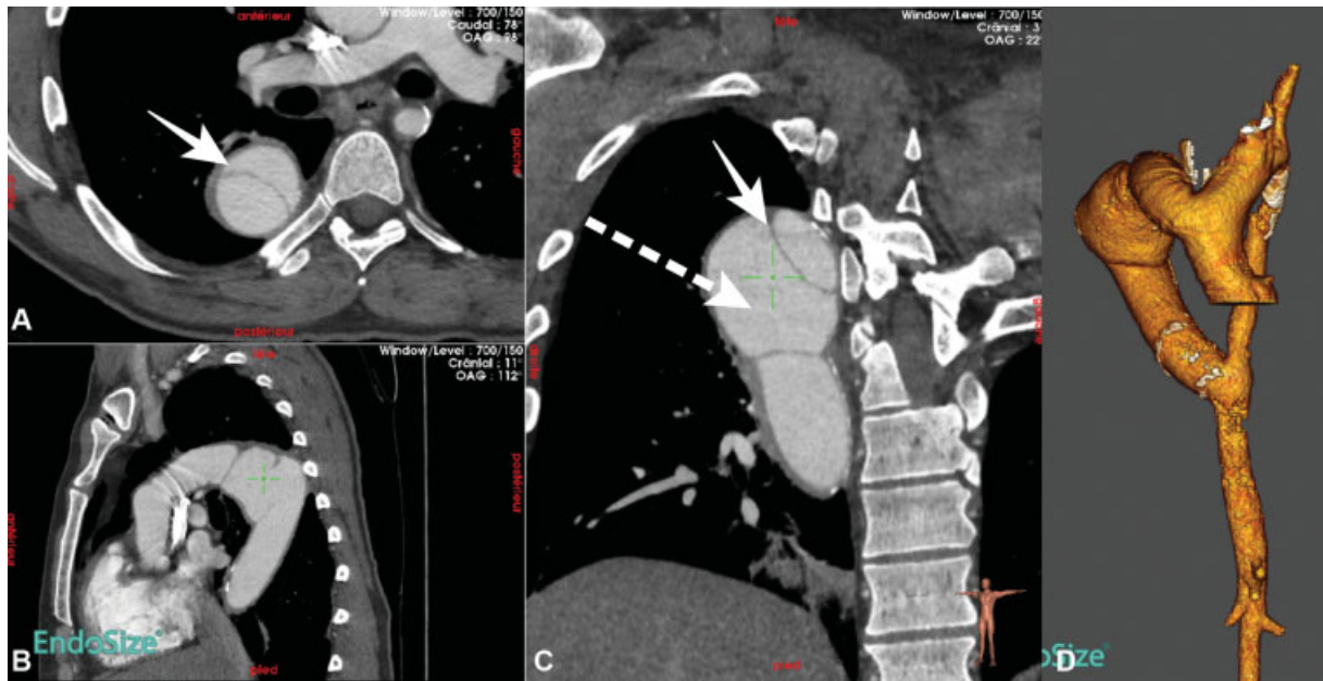
Fig. 1 Preoperative computed tomography scan findings with three-dimensional (3D) reconstruction, revealing dilatation of the Dacron graft and a pseudoaneurysm of the end-to-end anastomosis between the two Dacron grafts. (A) Axial view, (B) coronal view, (C) frontal view, and (D) 3D reconstruction. Continuous arrow, prosthetic flap; dashed arrow, pseudoaneurysm.