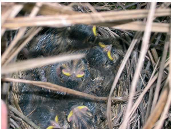
Figure 2. Reed bunting nestlings approx. 8 days old in northeastern Switzerland, 19 May 2005.

approach was also used to capture adult females. Adults were color-marked in the same way as nestlings, and social parents were determined by observation of color-ringed individuals during nest building, incubation and the nestling period. Each breeding pair was observed at least twice a week. At the time of banding, we collected DNA samples