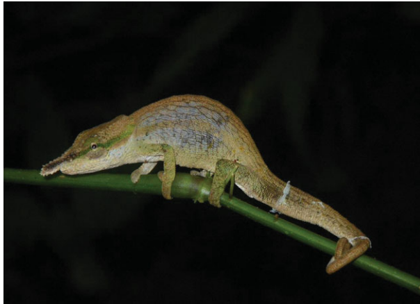
Figure 1. Male specimen of Calumma guibei from the Tsaratanana Massif, Madagascar, in life. Note the rostral appendage that is flexible and dermal (no underlying bony structure) in all species of the C. nasutum group, and the small occipital lobes which are characteristic for the species of the C. boettgeri complex.

subset of species, additional evidence from morphology or nuclear genes was available; following Vieites et al. (2009) we use the terms confirmed candidate species (CCS) for lineages supported by at least two independent lines of evidence, and deep conspecific lineage (DCL) if the available evidence rejects evolutionary independence and thus species status.