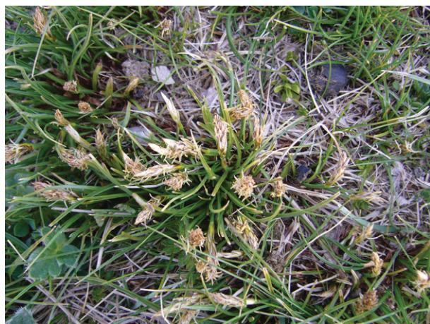
Figure 2. Plant of K. humilis .

species are perennials with asexual propagation as the main way of annual regeneration (Deng et al. 2001). Therefore, it's easy to recognize the transplanted plants.