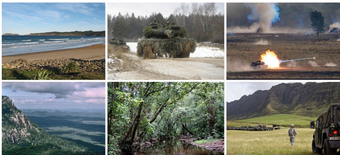
Figure 1 Clockwise from top left: Shoalwater Bay Training Area, Australia; a tank manoeuvring at a German military training area, German MTAs are proving to be refuges for wolf packs in western Europe; live fire exercise; Makua Military Reserve, Hawaii; Tully Field Training Area, Australia; military trainings areas contain varied landscapes including escarpments and coastal heathland.