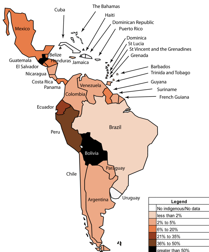
Figure 1. Percentage of indigenous people in Latin America and the Caribbean [5, 17, 45, 91].

searches identified 26 articles with reference to cancer among indigenous people, the majority relating to cervical cancer ( n = 11 ) and nine additional articles report cancer risk factors. Below, we describe the limited information on rates and cancer profile among indigenous peoples within LAC.