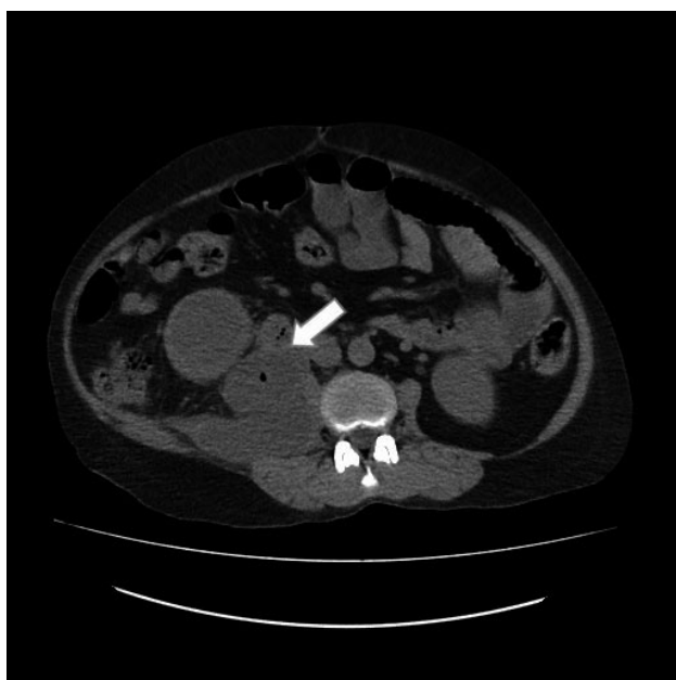
Fig. 2 The collection is posterior to the right kidney with foci of air extending to the right psoas muscle.

whereas others simply develop conventional UTI. Huang and Tseng 5 postulated four factors that are involved in the pathogenesis of EPN which includes gas-forming bacteria, high tissue glucose level, impaired tissue perfusion, and defective immune response. Our patient had uncontrolled diabetes as she was uncomplicated with diabetic medications which predisposed her to develop EPN.