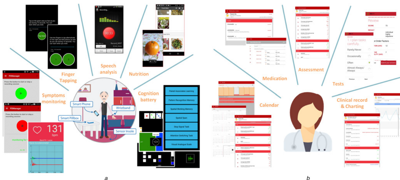
Fig. 2 Mobile application functionality for a Patients b Healthcare providers

from a similar red stop button. If an issue emerges the app alerts the patient and/or caregiver and proposes a possible solution. Some sensor data can be shown in real time if necessary. A very useful feature is the ability to alert the patient when the battery of the sensors is running low to recharge the devices. The monitoring system was designed to require the minimum user intervention possible (i.e. start/stop the recording session and recharge the batteries).