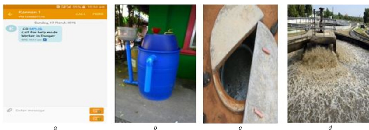
Fig. 4 Various sources of hazardous gases and alert system

3.2. Test conducted in septic tank of an organisation: In an educational institution, human urinal wastes were collected and then the purification process was carried out. Testing was done at the septic tank opening and at the places of various stages of the purification process. We analysed that the concentration of the methane and carbon monoxide differ from one place to another.