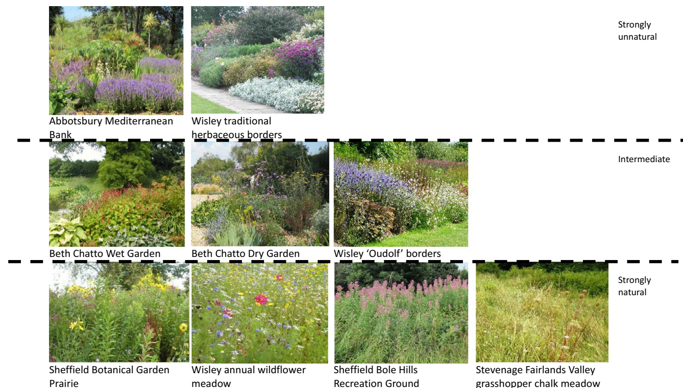
FIGURE 4 Images of the herbaceous sites used in the study, showing the gradient of planting structure from strongly unnatural to strongly natural

questionnaires. The percentage vegetated surface covered by flower was recorded.