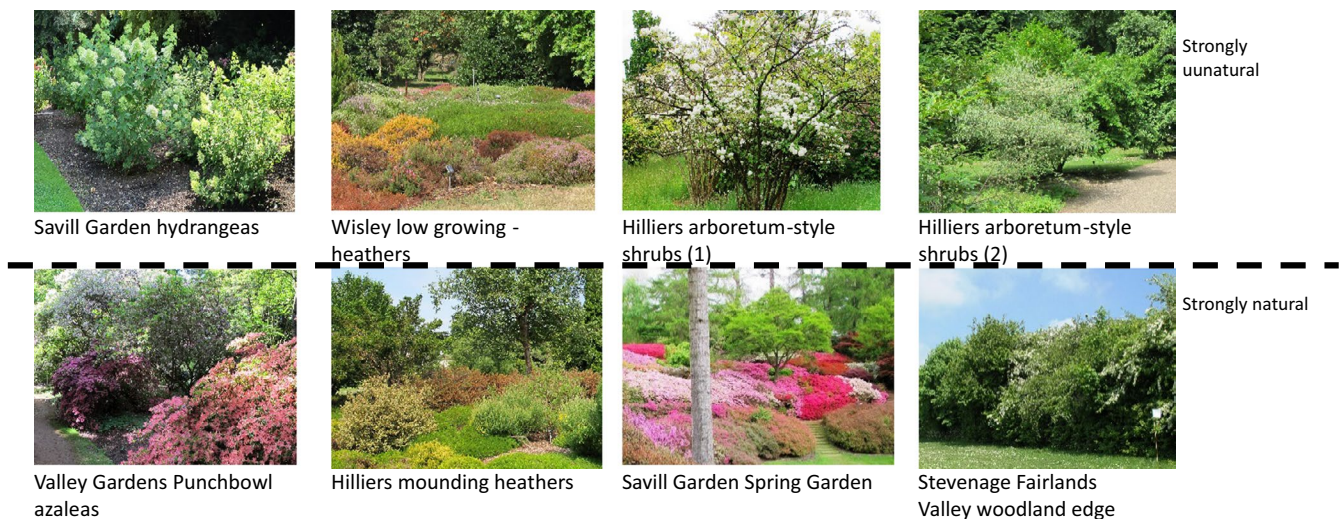
FIGURE 3 Images of the shrub sites used in the study, showing the two levels of planting structure: strongly unnatural and strongly natural

other species, resulting from deliberate planting or placement. In the case of woodland (Figure 2) and herbaceous (Figure 4) planting all three structures were represented. In the case of shrub planting (Figure 3), where diversity of form in designed green spaces is less varied, two were represented, with the