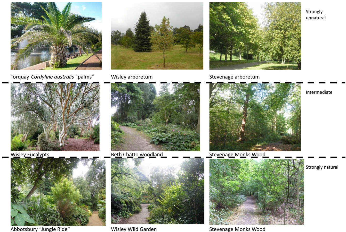
FIGURE 2 Images of the woodland sites used in the study, showing the gradient of planting structure from strongly unnatural to strongly natural