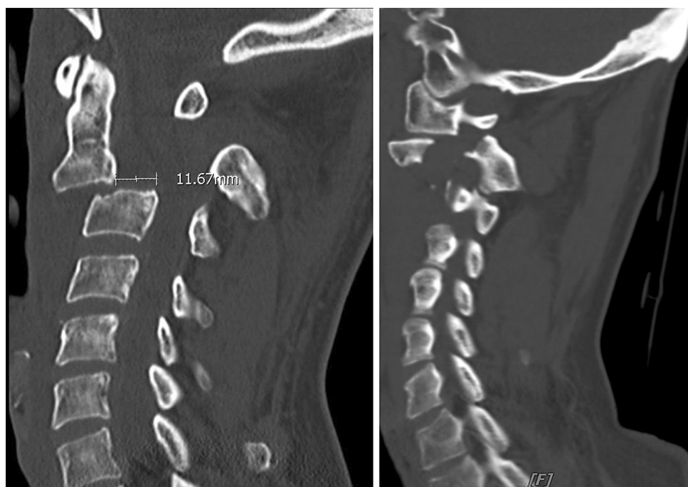
Fig. 1 a Initial sagittal CT demonstrating bilateral fractures of the C2 pars interarticularis, with anterior subluxation of C2 over C3 and 1.2 cm of displacement in the sagittal plane. b Same sagittal CT demonstrating locked C2/C3 facet joint

lacking in this regard and it is the authors' suggestion that future studies include functional outcome scores as a means of differentiating the most beneficial treatment for an individual patient [4]. According to the review, 74% of all Hangman's fractures are treated non-operatively with a halo fixator, while the remaining quarter are usually Effendi type IIa and III injuries in which the axis has been determined to be unstable and thus an appropriate candidate for surgical intervention [5]. An anterior fixation via plating or fusion due to disk injury is a common method of fixation as disk injury itself confers instability [6–8].