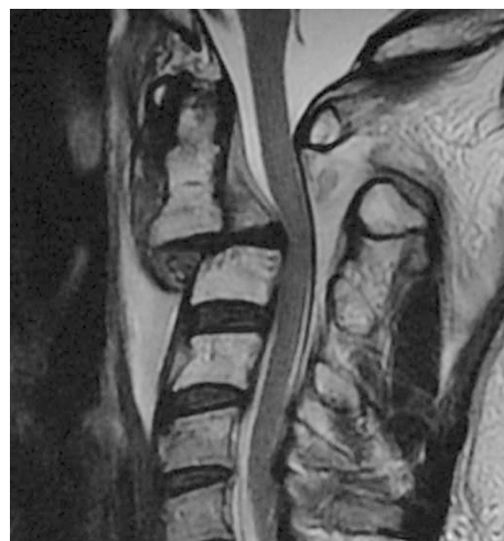
Fig. 2 Initial sagittal MRI demonstrating granulation tissue and healing of the surrounding soft tissue, severe central stenosis and damage to the ALL, PLL and disk

In 2006, Li et al. conducted a systematic review on the management of Hangman's fracture and included 32 papers for analysis. The review included authors who argued for different treatment options and indications for management. The review was only able to include the healing rate as a measure of final outcome with no patient reported outcome score such as the neck disability index (NDI) or other questionnaire. In general, the literature is