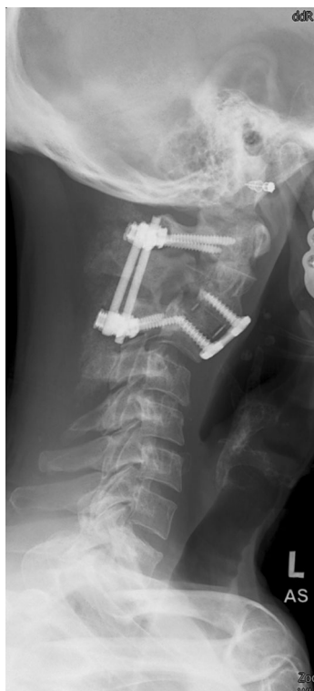
Fig. 5 Radiographs at 6-month follow-up revealed good placement of all implants with good reduction and maintenance of reduction at C2–C3 level

cannulate down the C1 lateral mass. Twenty-six millimeter screws were placed in the bilateral lateral masses of C1 as well as C3 with good purchase. All bony processes were decorticated. A rod was cut, contoured and placed into the tulips of the lateral mass screws at C1 and C3 posteriorly. Final radiographs revealed good placement of all implants with good reduction and maintenance of reduction at C2–C3 level (Fig. 5). The wound was closed, sterile dressings applied and hemovac placed.