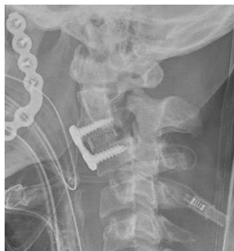
Fig. 4 Sagittal X-ray following ACDF C2–C3 demonstrating 6.1 mm displacement

On post-op day five, the patient returned to the operating room for the second stage of his fusion via posterior approach. The patient was placed in the prone position and the Mayfield head holder was attached to the table in secure position. Using fluoroscopic imaging, the reduction maneuvers were performed to allow maximal extension to bring the C2 body into anatomical alignment. Once this was accomplished, the posterior portion of the neck was prepped and draped in sterile fashion and a midline incision was made from the base of the skull to approximately C4. After appropriate dissection, it was noted that the C1 posterior arch had been subluxed anteriorly. The facet joint of C2–C3 was exposed laterally and the C3–C4 joint was exposed with preservation of the capsule. Under fluoroscopic visualization, a high speed drill was used to