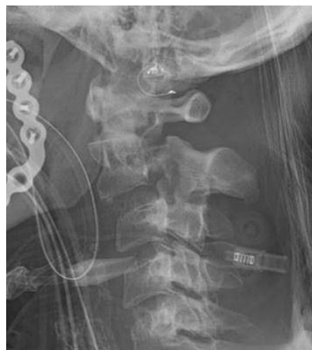
Fig. 3 Post-reduction sagittal X-ray with 6.1 mm displacement

With maintenance of successful closed reduction, the patient was brought to the operating room the following morning for ACDF of C2 and C3, the first stage of a two-staged procedure. The patient was prepped and draped in a sterile fashion and under fluoroscopic imaging the C2 and C3 bodies were visualized. A 2-cm midline incision was then made between them followed by dissection of the soft tissues and platysma which revealed a marked amount of granulation tissue, edema and hypertrophy of the ALL. Once the disk space was visualized, annulotomy was performed. The disk space was visualized and it was noted that the nucleus pulposus was completely sheared off. The disk material was then removed and posterior dissection was carried out all the way to the posterior osteophyte. Using microscopic visualization, the endplates were prepared with placement of autograft and allograft spacer device. The anterior cervical plate of 14-mm was placed and appropriate-sized screws were inserted. Final radiographs were then obtained (Fig. 4), the wound was irrigated, closed and a hemovac drain was placed.