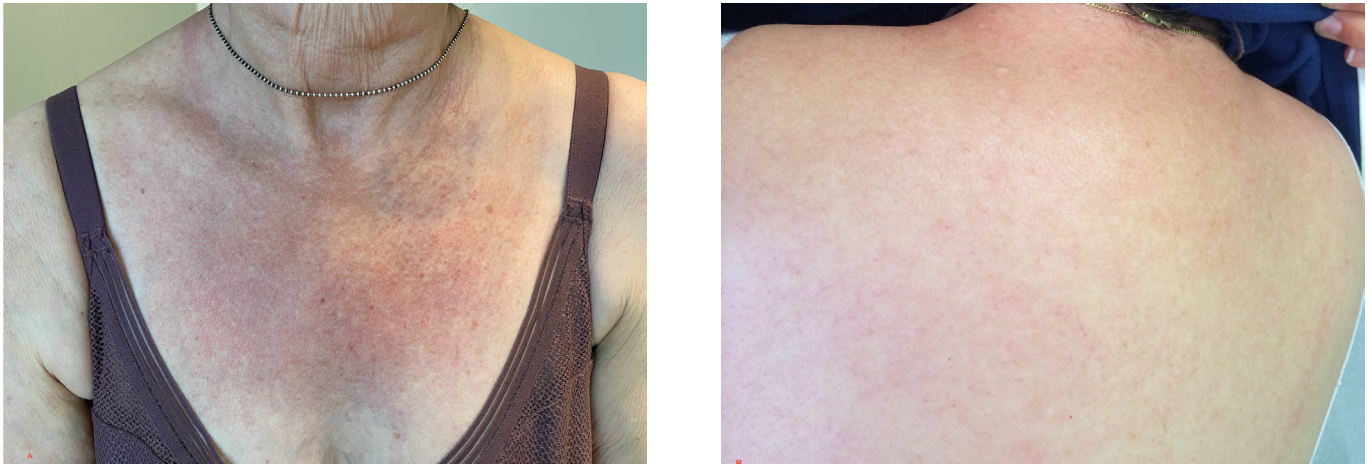
Figure 1. Polymorphous (a) and morbilliform (b) rash observed in two patients with IPAF included in our cohort.