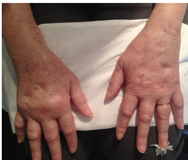
Figure 1. RS 3 PE syndrome. Diffuse swelling of the hands with pitting oedema and synovitis of the metacarpophalangeal joints on the right hand.

On clinical examination, there was synovitis of the wrists and metacarpophalangeal joints of both hands, more prominent on the right, and a marked diffuse swelling of both hands, with a pitting oedema ( Figure 1 ). Ultrasonography revealed diffuse subcutaneous oedema of her hands and tenosynovitis of the extensor tendons ( Figure 2 ).