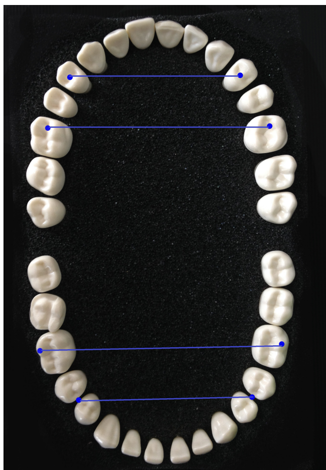
Figure 1. Landmarks used for measurements in maxillae (on top) and mandible (on bottom).