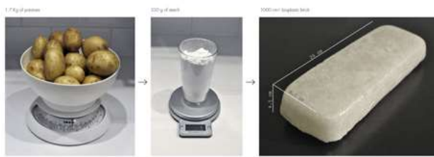
Figure 2. Bioplastic brick by Marilu Valente [7].