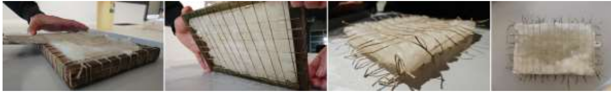
Figure 10. Bioplastic with linen grid, Dimension: 15x22x0,8 cm.