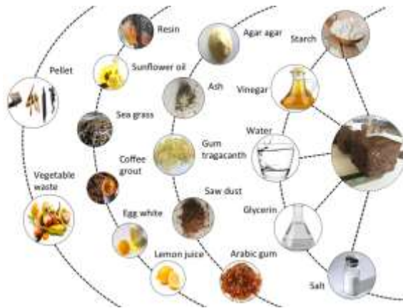
Figure 7. Used additives in order to improve mechanical properties of bioplastic; biopolymers and plasticizers for bioplastic.

Agar agar (E406) is a biopolymer and a polysaccharide derived from red seaweed and is used in food industry. In the experiments agar was used in powder form [2, 166]. Bioplastic mixture was poured in liquid jelly form which resulted as cracks on the surface. Instead solid mixture displayed much better results. It was observed that agar agar acts as a strong biopolymer for starch based bioplastics, as well as dried skin of various fruit and vegetables such as pumpkin seed, fig and corn leaf.