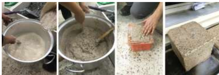
Figure 6. 50% Bioplastic, 50 % Mixture: (Aggregate:0/4 mm), Steel mold, Dimension: 15 x 15 x 15 cm.

Pure bioplastic was mixed with 0-4 mm. aggregates in order to improve the properties of strength. These specimens were molded with 15x15x15 cm steel concrete molds. The results were observed as sponge-like, lightweight material with some cracks on the surface due to open-air drying (Figure 6).