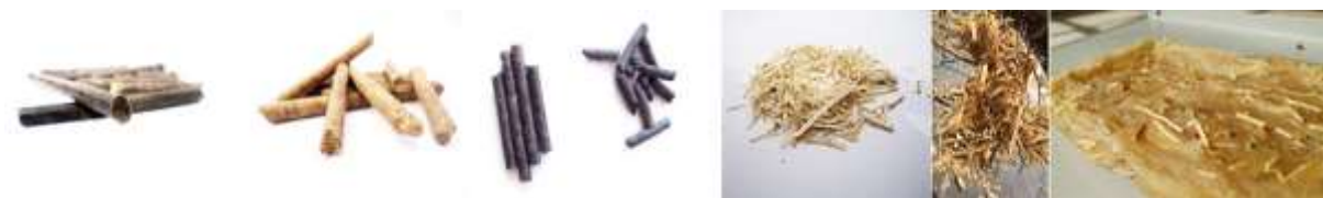
Figure 11. Pellets and natural fibres used in experiments, 1. Canola stalk pellet, 2. molasses pellet, 3. canola and coal dust pellet, 4. molasses and ash pellet [From left to right] and different natural fibers, Dimension: 15x22x0,8 cm.

Pellets are compressed agglomerates used for making biodiesel such as canola or sunflower waste. They help save fuel resources. In our experiments, canola pellets were used in 6x6x6 cm and 15x22x0,8 cm specimens. It was observed that pellet use increases the endurance of the specimen, making it strengthful. Sea grass ( Posidonia oceanica ) has been used by Neptutherm firm as an insulation material. It was observed that the use of small particles of this seaplant provide sufficient hardness and endurance for bioplastic (Figures 11, 12, 13).