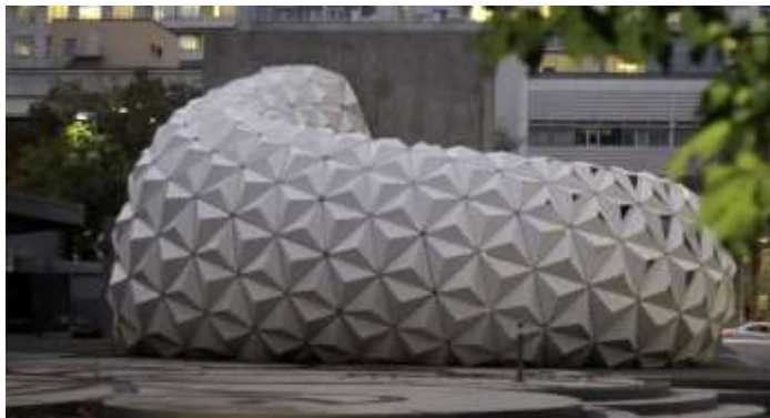
Figure 3. Arboskin pavillion, Stuttgart [8].

Along with these experiments of bioplastic in architecture, further research needs to be done in order to evaluate the performance of starch based bioplastic in architecture. Therefore, deriving from ecological means and the above mentioned examples from an architect or artist approach to bioplastic, this research aims to find out possibilities of starch based bioplastic and biocomposite as a construction material. The focus of this research is to figure out whether starch based bioplastic material can be used in architecture, both as a facade material and an interior space furnishing. The research also aims to understand whether the material can be used alternatively to the cement as a connective material in concrete or perform better when blended with natural and other synthetic fibers. Within the research, vegetable based starch is blended with different additives and biopolymers, natural fibers such as pellet (compressed sunflower, canola and other agricultural waste) and synthetic fibers in order to improve a strength and durable material. The project aims to produce a biocomposite material consisting of organic and inorganic materials that can be used as a surface and furniture. The research expands to understanding how organic and inorganic interventions can be made in order to increase the life span of the material, make it durable and resistant to humid and weather conditions [9].