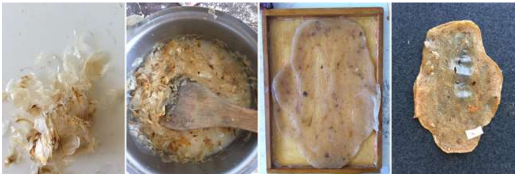
Figure 8. Dried skin of pumpkin seed as a biopolymer with agar agar potato starch bioplastic.

When the blend is poured on a natural rubber or EVA surface rather than steel, glass or wood surface, less crack or deformation on the surface was formed (Figures 8, 9, 10).