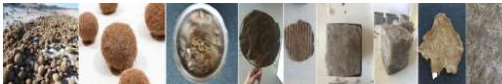
Figure 13. Seagrass ( Posidonia oceanica ) collected from shores of Albania, [14, 15]. Seagrass and canola pellet potato starch bioplastic and pure seagrass potato starch bioplastic, Dimension 5x5x5 cm and potato starch bioplastic with seagrass.