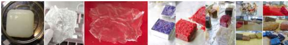
Figure 5. Pure potato and corn starch bioplastic, potato starch in sheet form and corn starch colored modules from the exhibition, realized in a workshop during Tirana Architecture Weeks by students of Polis University in Tirana.

Pure bioplastic was gained with 6x6x6 and 15x22x0,8 cm steel and wooden molds. It was observed that pure bioplastic specimens are not resistant to humid and compression and cracked. Potato, corn, wheat and tapioca starch were used and it was observed that tapioca starch works as the best type of biopolymer in the formation of bioplastic and secondly the potato starch, thirdly wheat starch. The figures show pure three-dimensional specimens (Figure 5).