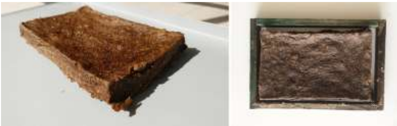
Figure 12. Canola pellet with bee wax, Dimension: 15x22x0,8 cm.