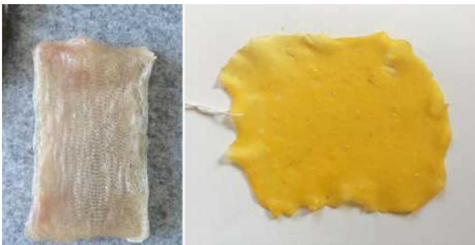
Figure 9. Tapioca starch with agar agar bioplastic.