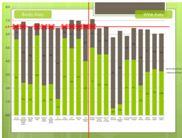
Figure 2. System architecture

Observation and calculation are done, and finally, the problem and its solution to deduct the cycle time from 7" to 6.5" are found. In the process, the most problematic condition, such that the production of oxygen sensor may be postponed, is located in the region of body assembly of oxygen sensor. Difference of body assembly and wire assembly of oxygen sensor production cycle time and problem of not reaching 6.5" target are shown in Figure 2.