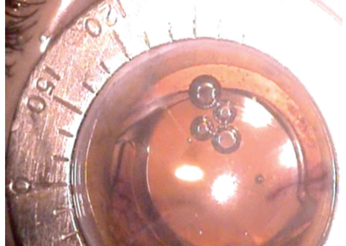
Figure 3: Immediate postoperative period. Note the overlap of the Sulcoflex™ IOL haptics with the primary IOL haptics.

LASIK that they induce reduced fluctuations in daily vision (8) because they can correct higher order aberrations. However, several authors agree that these alternatives are only valid for mild and moderate hyperopia (up to approximately 5.00D) (9-12) .