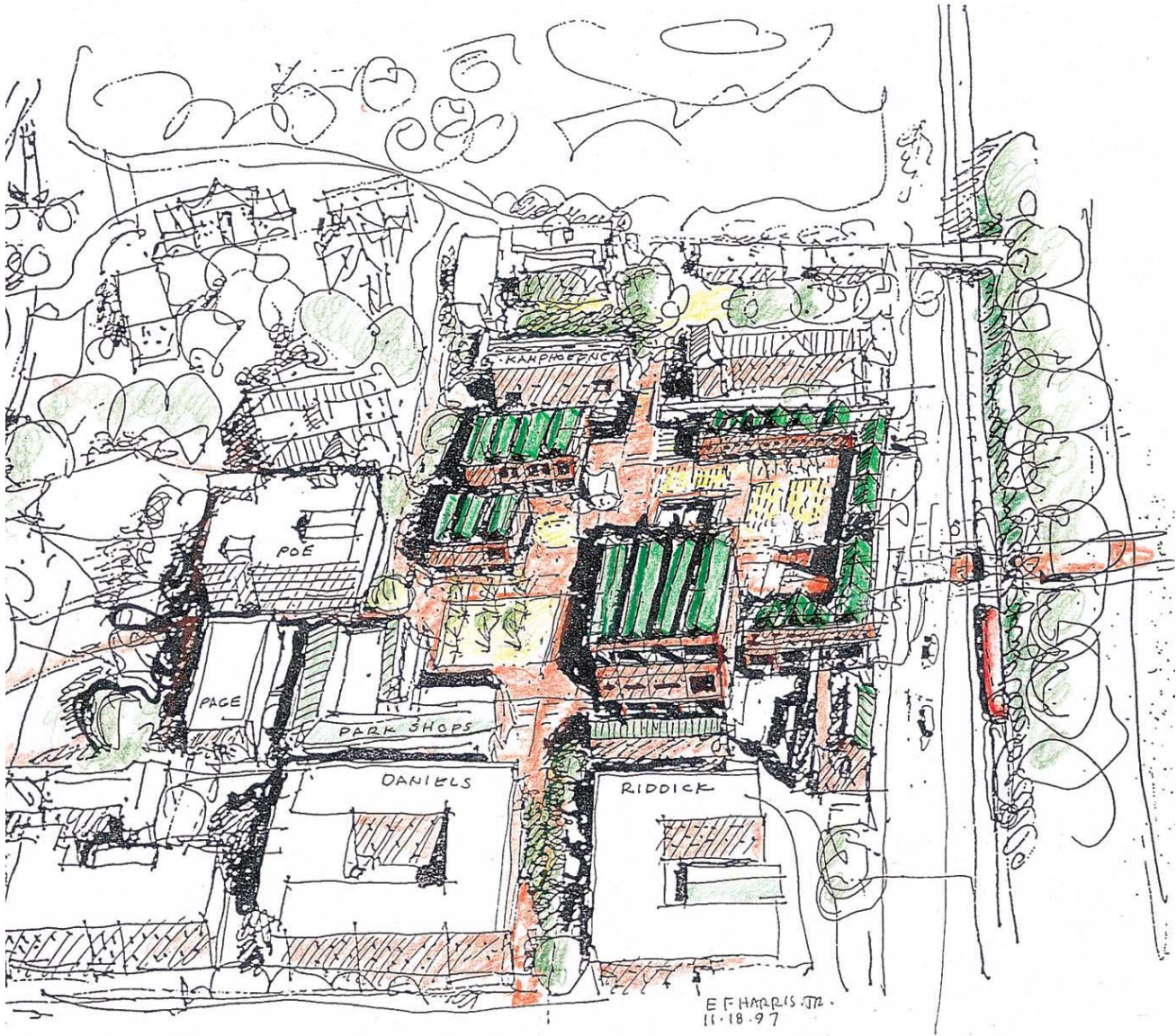
Proposed Riddick Stadium redevelopment