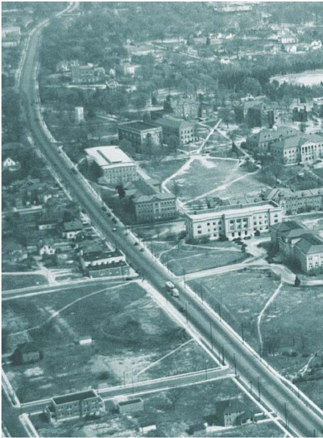
1906 campus map

In 1960 the university established the Campus Planning Office, which updated the 1958 plan. It defined a compact, high rise, pedestrian-scaled campus based on a ten-minute walking radius—all essential services were to be within a ten-minute walking distance. The plan for the university's urban center was thus established.