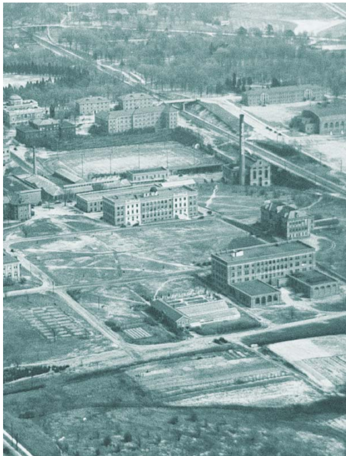
Early courtyard and paths

"Campus Environment and Planning System," a 1968 in-house report, endorsed the compact campus center but also suggested some decentralization through dispersal of activities. This marked the emergence of the idea that the campus could be a group of neighborhoods. The