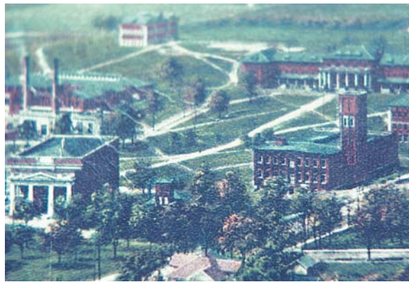
The Court of North Carolina

From the university's pastoral beginning along Pullen Road, enrollment and facilities grew steadily and moderately until the end of the First World War, after which they accelerated. Plans of the 1920s called for grouping buildings that housed linked activities, such as the agriculture and engineering groupings on the North Campus, classrooms around the Court of North Carolina, the "executive group" near Holladay Hall, athletics around Riddick Stadium, and student residence halls south of the railroad.