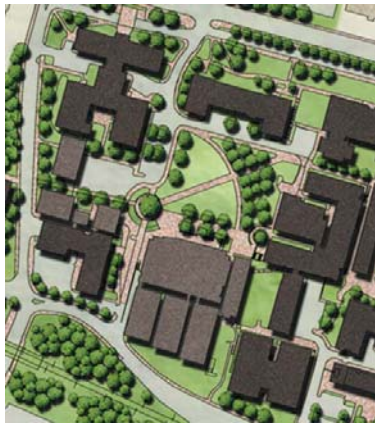
Proposed neighborhood on North Campus

The Introduction includes the university's acknowledgment of and thanks to all who participated in the crafting of this plan, the chancellor's introductory message, the Table of Contents accompanied by this Overview, and a description of the processes that led to the creation of A Campus of Neighborhoods and Paths . The latter section includes a brief history of the development of the campus to provide a context for the plan.