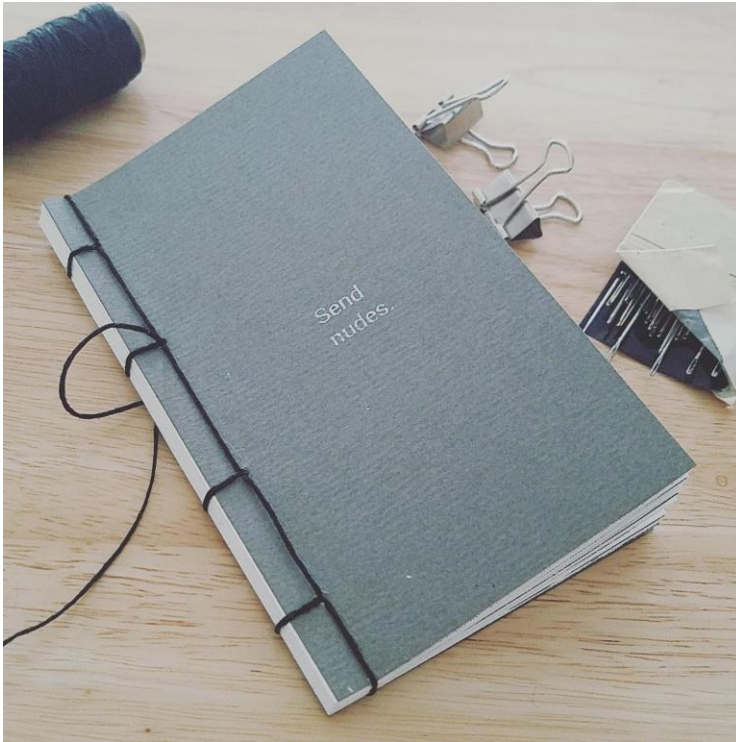
Figure 5. Send Nudes , 2018