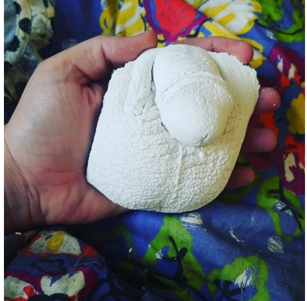
participants an opportunity Figure 7. Penis Casting , 2018

For this project I asked participants to allow me to create a life cast piece from their groin area. However, there was a catch, the artifact to be created was not only a cast penis, but also a video of them enduring the process to be shown in the gallery along with the life castings. My intention with this work was to offer the