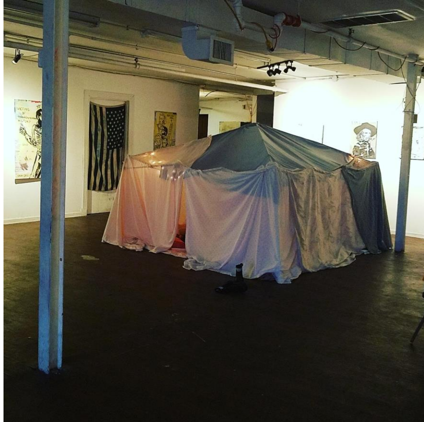
Figure 1. Pillow Fort , 2019.