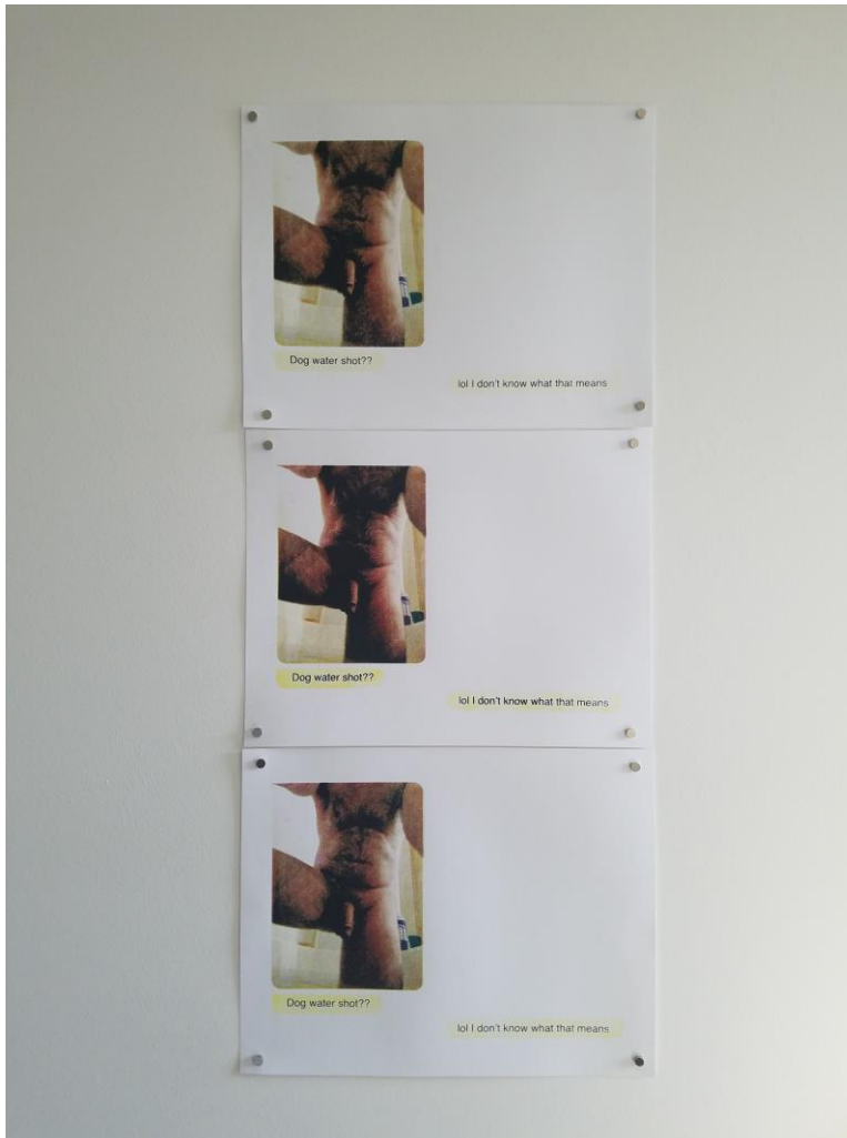
Figure 3. Sext No.3 , 2018.

opportunity for others to self-disclose in this manner and many viewers reached out to me after seeing the work to ask if they could participate.