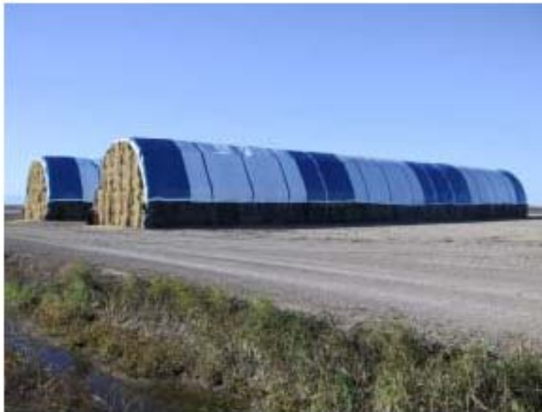
Figure 4-12. Tarped rice straw in storage on growers site.

The following Figure 4-12 shows tarped rice straw stored on a rice grower's property. Tarping is effective for short-term storage. Tarping costs range between $5 - $8/BDT depending upon how extensively the stacks are covered.