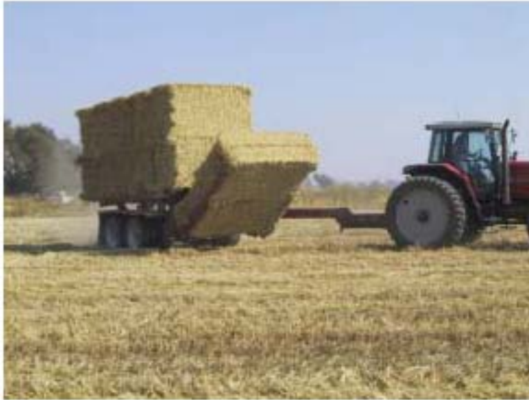
Figure 4.7. Retrieving 12 large bales per load from the rice field.

The following Figure 4-7 shows another piece of equipment for picking up large rice straw bales from the field. This machine can pick up 12 bales per load for stacking roadside.