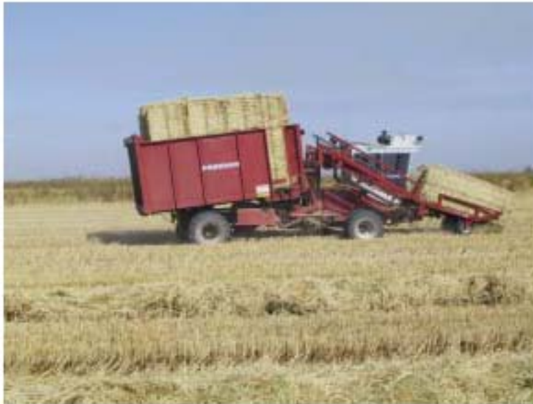
Figure 4-6. Freeman Stackwagon retrieving bales from field.

The following Figure 4-6 shows one method of retrieving large bales from the field. This machine has the capability to pick up 8 bales per load.