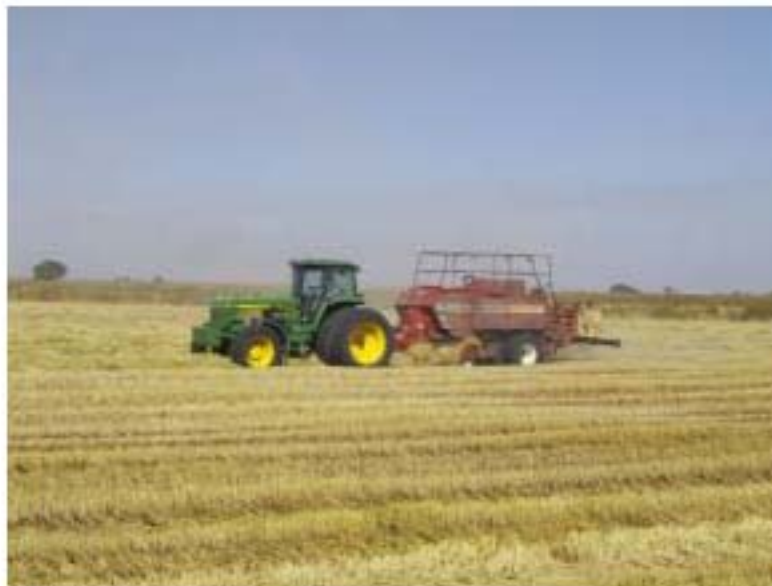
Figure 4-5. Baling rice straw utilizing a large bale baler.

Figure 4-5 shows a Hesston large bale baler making 36"x48"x96" bales weighing from 975 to 1025 pounds, with 11 – 15% moisture contents.