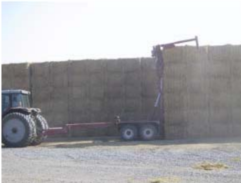
Figure 4-8. Stacking large bales at a grower's roadside site.

The following Figure 4-8. shows rice straw bales stored at a roadside location, awaiting transport to a user.