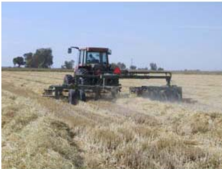
Figure 4-4. Raking rice straw in preparation for baling.