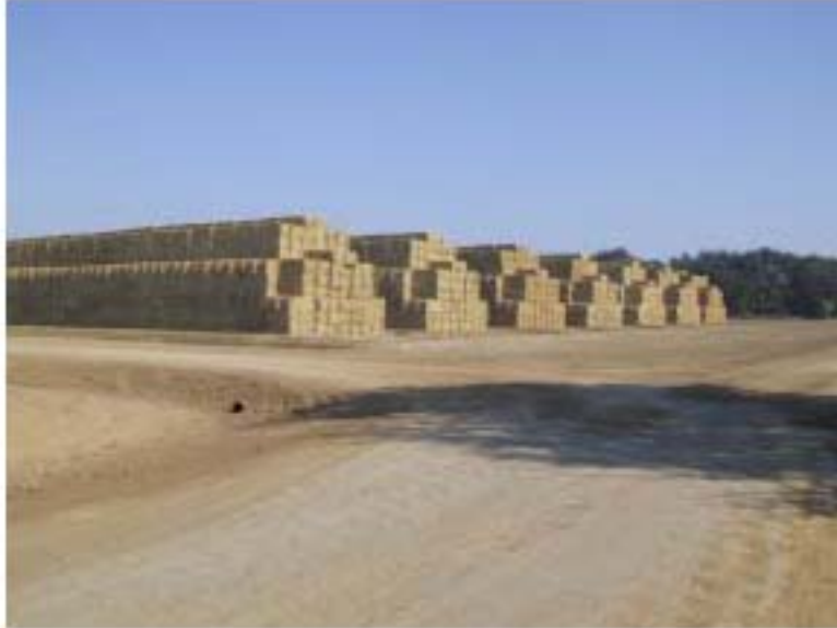
Figure 4-11. Uncovered rice straw in storage.

The following Figure 4-11 shows rice straw in storage on prepared pads. These stacks were constructed 32 feet wide and 30 feet high at the peak. Each stack contains approximately 1,000 BDT.