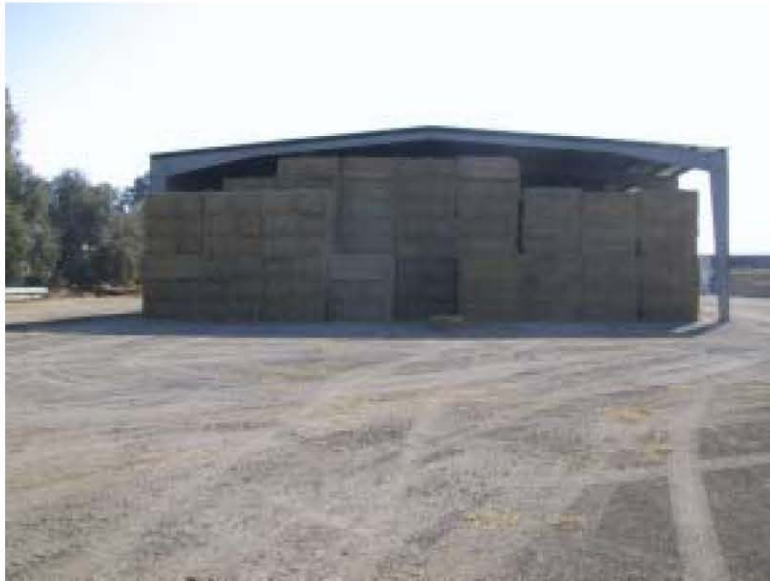
Figure 4-13. Rice straw stored in a barn on grower's property.

The following Figure 4-13 shows rice straw stored in a barn. This type of storage is recommended for longer-term storage (more than one year). The initial cost of a barn is approximately $50/BDT for a barn that will store approximately 2,000 BDT. In this case, the cost is approximately $7/BDT on an annual basis. Barn storage provides the best protection for rice straw, eliminating losses due to water entering the stack either when tarps become separated during bad weather or when water seeps up from the bottom of a stack.