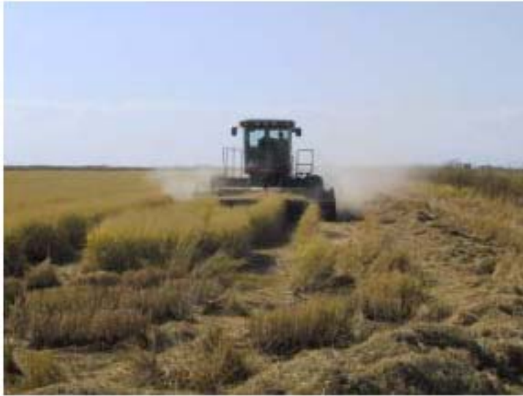
Figure 4-3. Rotary swather cutting stripper header rice straw.

The following Figure 4-3 shows a self-propelled rotary swather cutting stripper header harvested rice straw. After rice harvest, the swather can also cut the remaining stubble by a conventional header harvester to maximize the volume of straw per acre collected. Swathing rice straw is expensive, approximately $10 per acre or $5/BDT for stripper header straw.