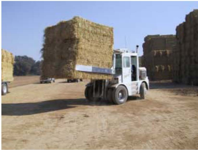
Figure 4-9. A squeeze loading rice straw for transportation to a user.

The following Figure 4-9 shows the loading of a truck for transportation to the facility. This equipment, commonly known as a squeeze, can efficiently load and unload rice straw and stack bales for storage.