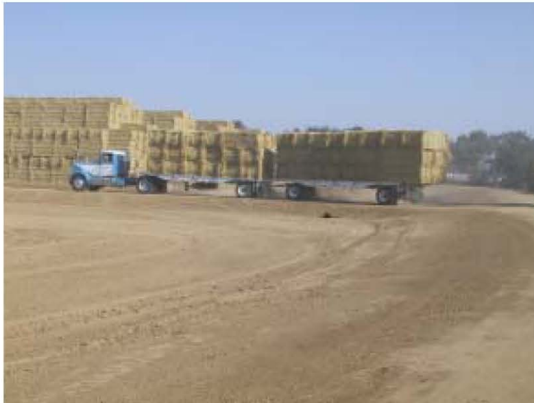
Figure 4-10. A truck loaded with rice straw arriving at a satellite storage area.

The following Figure 4-10 shows a truckload of 36" x 48" x 96" foot bales of rice straw on its way to the storage area. Note that the bales can be stacked three high.