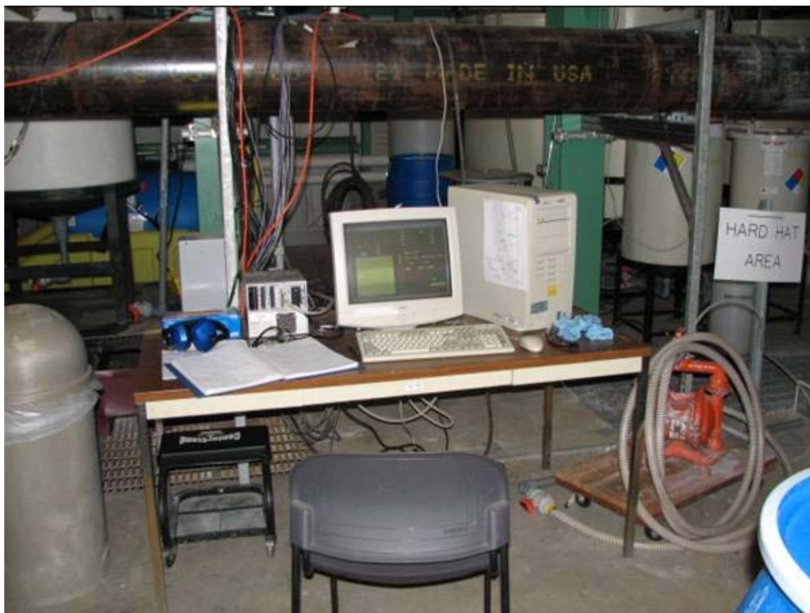
Figure 7. Photograph of Data Acquisition and Control System