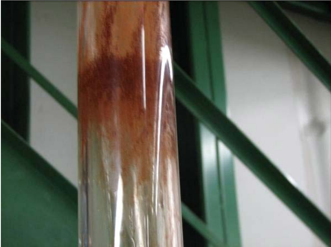
Figure 22. First Clear Section After One Wash

At the conclusion of 400 cycles, two automatic wash cycles were performed. Figure 22 shows the first clear section after one wash. Note that the dark area in the middle is the simulant fill line during each cycle and consequently had a heavier coating.