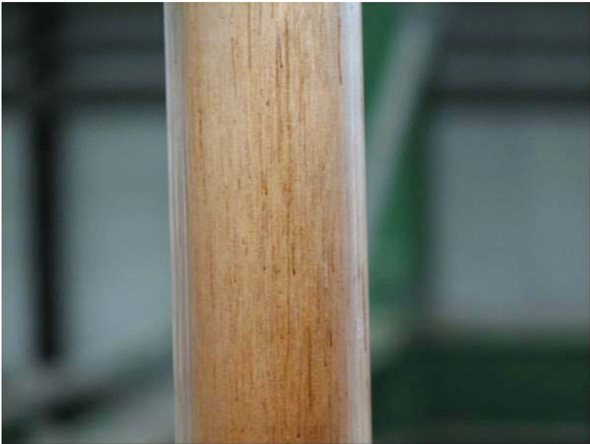
Figure 18. First Clear Section after 10 Cycles of AZ-101

Figure 18 shows the streaks of AZ-101 droplets after 10 cycles.