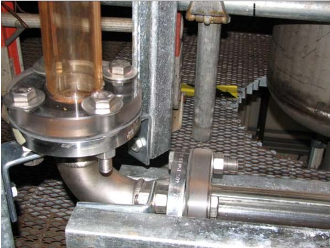
Figure 21. Third Clear Section After 400 Cycles of AZ-101, Test 15

Figure 21 shows the discoloration of 3 rd clear section after 400 cycles of AZ-101 run. Clearly, no streaks or surface film was observed. The discoloration is due to AZ-101 aerosol deposit.