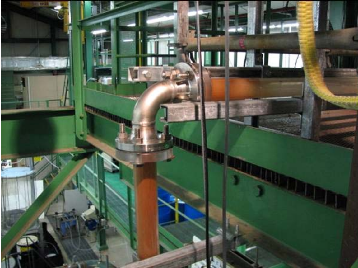
Figure 17. Test Section after 100 Cycles of AZ-101 Simulant, Test 14

Figure 17 shows the AZ-101 deposit on the first horizontal section immediately after the first elbow. The filter bag was not removed after this test. The AZ-101 carryover in the filter bag was measured in the long term test 15.