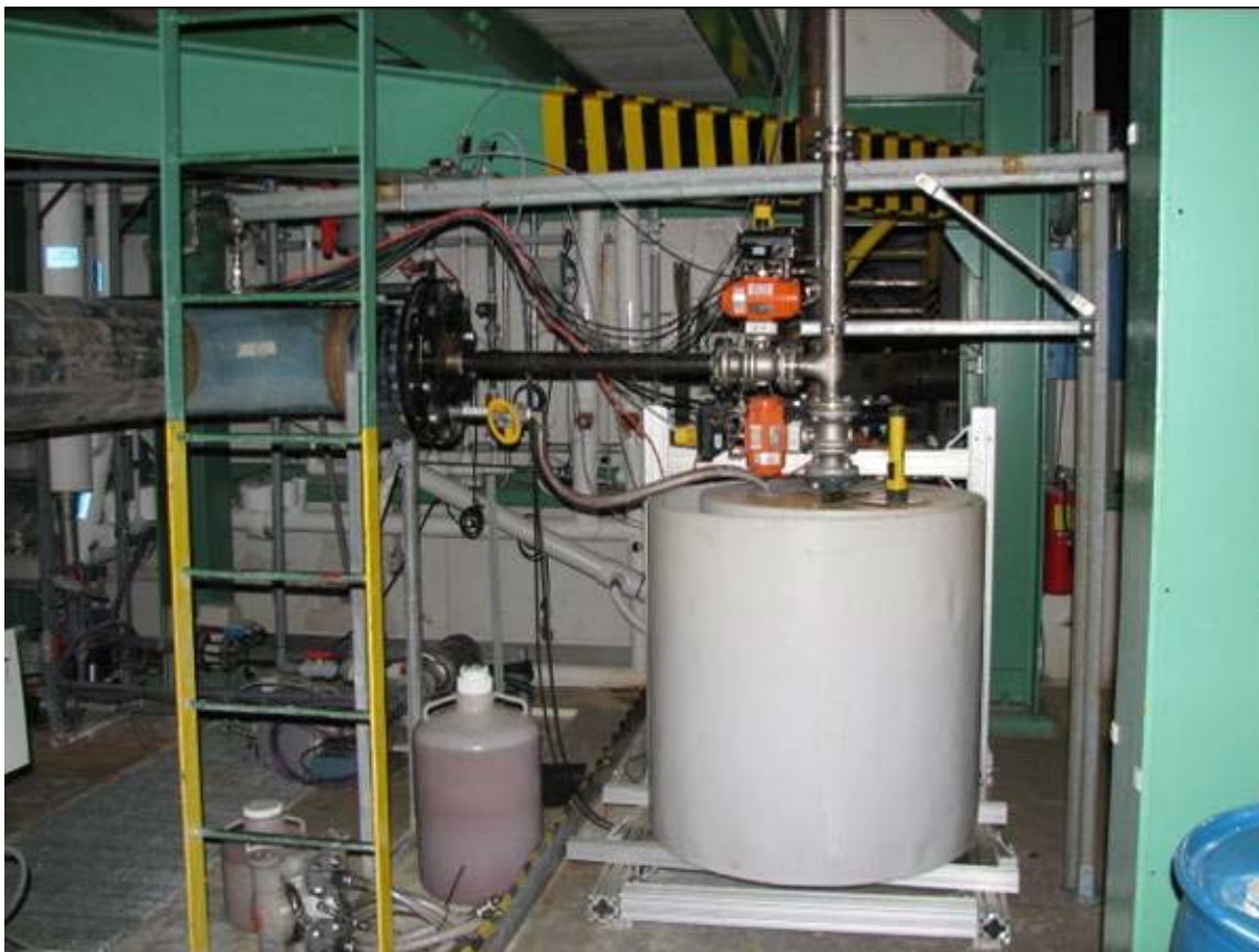
Figure 4. Photograph of Test Facility showing connection to 28 cu ft Volume