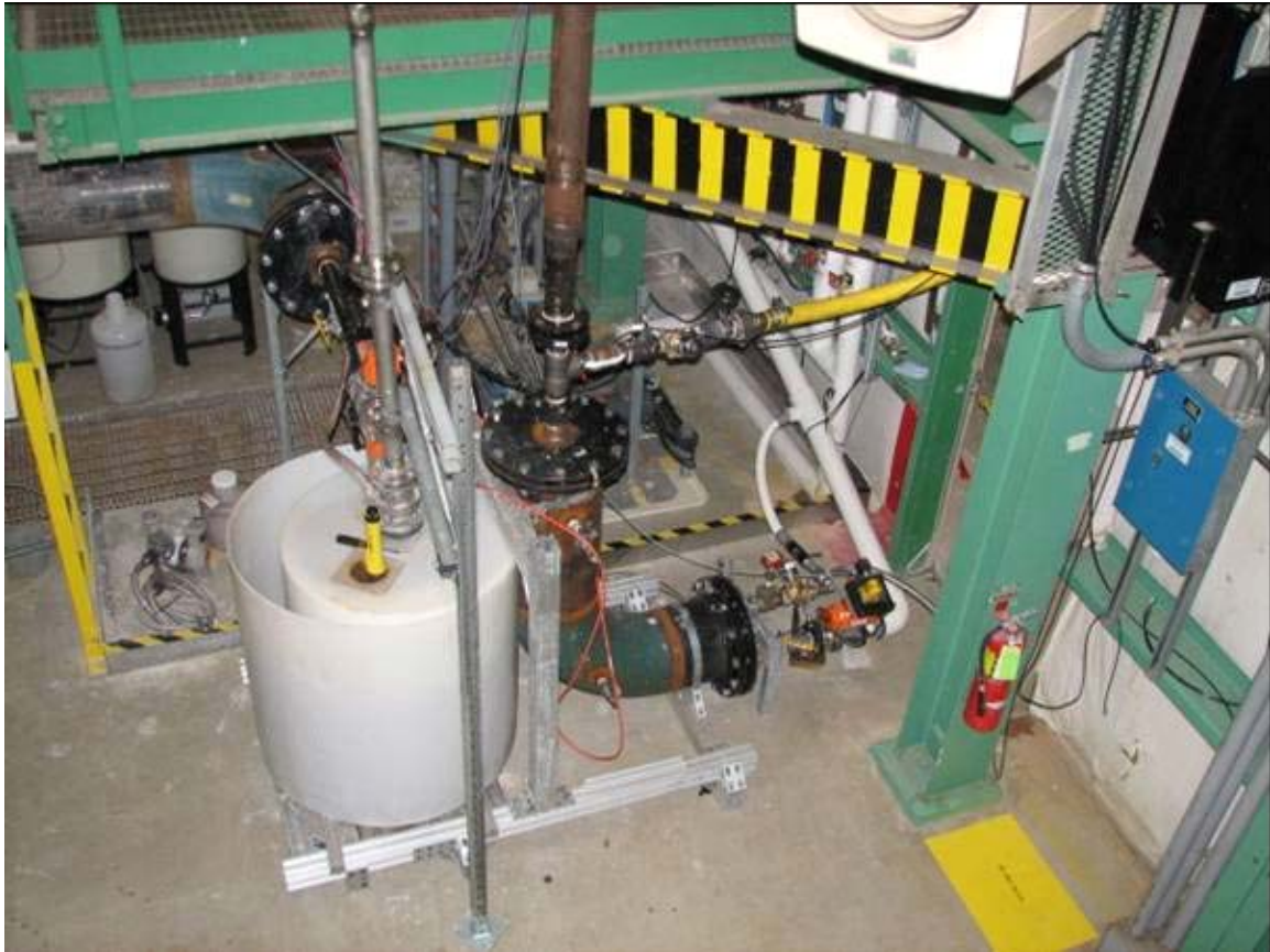
Figure 3. Photograph of Test Facility