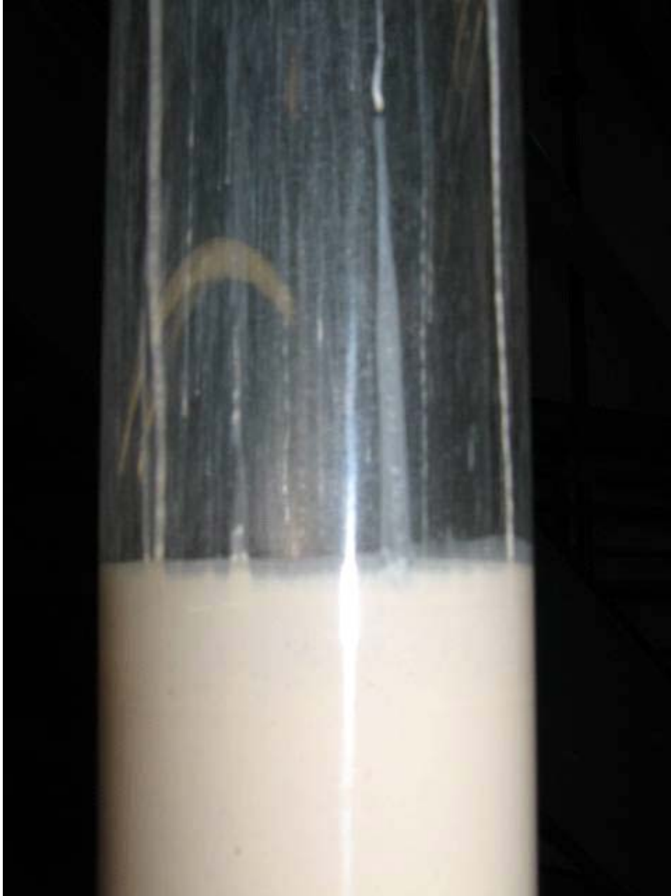
Figure 11. Simulant Fill Line and Streaks During Test 12 after 2 Cycles

Figure 11 shows the fill line and streaks of the simulant in the clear test section after first two cycles.