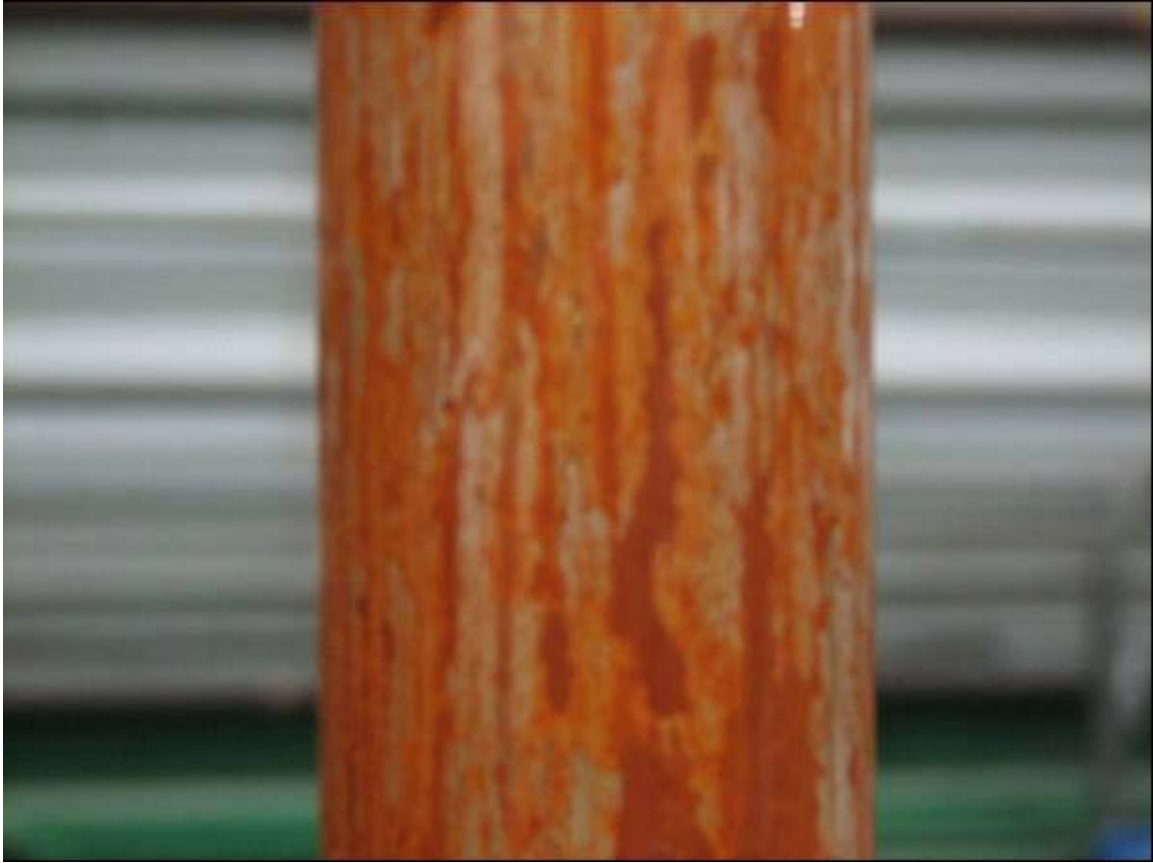
Figure 19. First Section after 400 Cycles of AZ-101, Test 15

Figure 19 shows the first clear section at the end of 400 cycles. The entire section is full of simulant streaks. The primary mechanism of this deposit is due to droplets entrained in the dome.