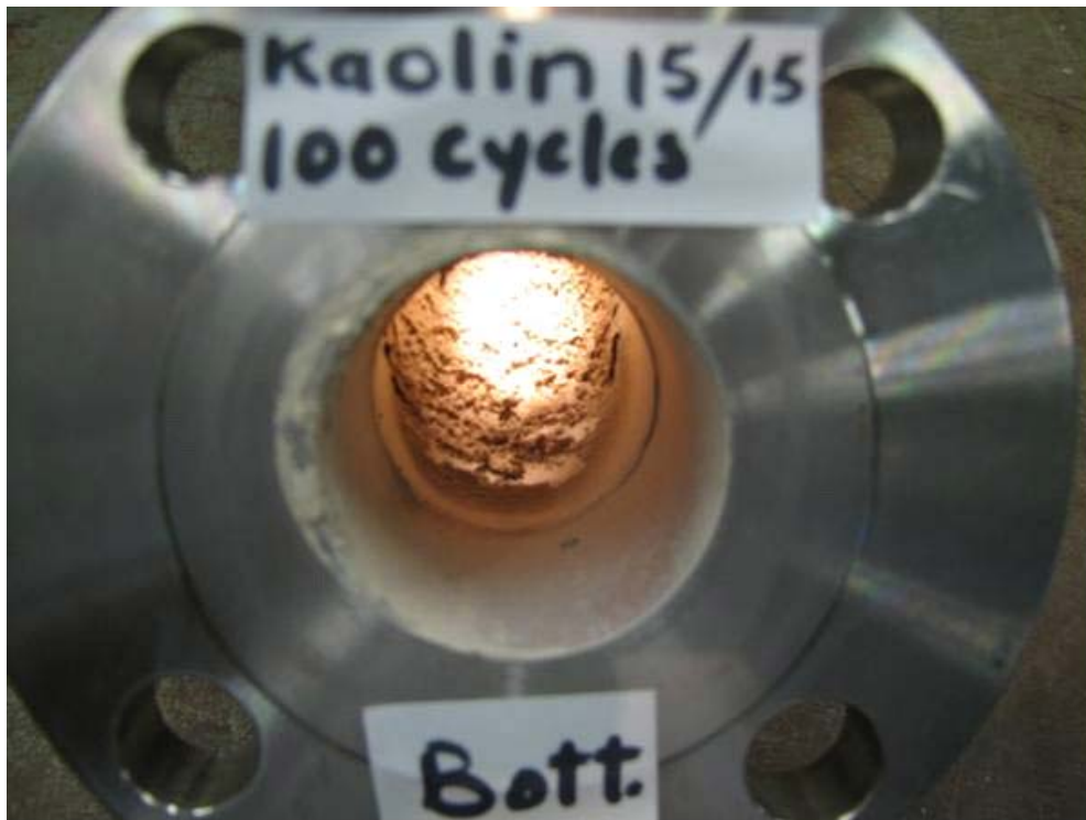
Figure 10. Kaolin/clay Buildup inside First Elbow for Test 11