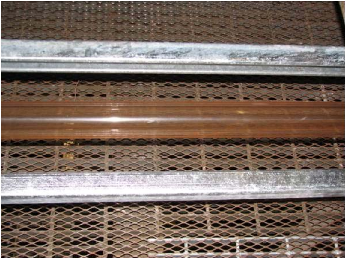
Figure 20. First Horizontal Section after the First Elbow after 400 Cycles, Test 15

Figure 20 shows the first horizontal section after the first elbow. It is clear that almost all the droplets were separated out by the first bend and the test section has some discoloration due to aerosol deposits.