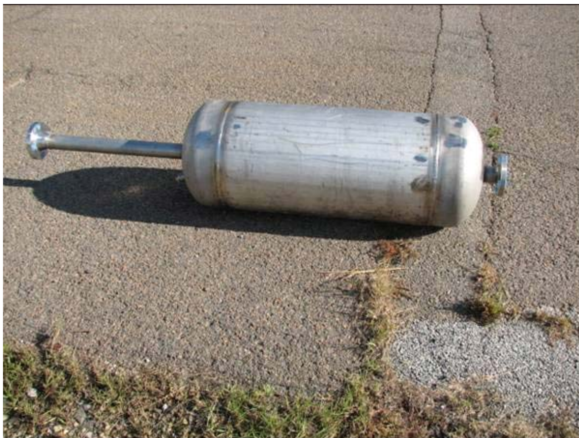
Figure 5. Photograph of 14” Dome used for Tests 10 – 13