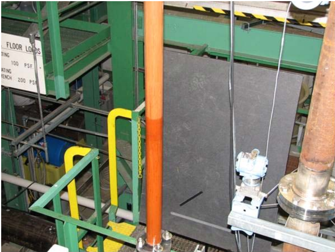
Figure 16. Test Section after 100 Cycles of AZ-101 Simulant, Test 14

Test 14 was conducted under the same operating conditions as in Test 13 ( V/D = 1.3 ). No surface creep was observed after 100 cycles. However, the first clear section became very cloudy due to droplet and aerosol entrainment as shown in Figure 16.