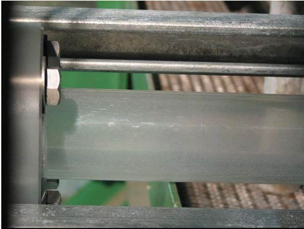
Figure 9. Droplet Streaks in the First Horizontal Section after 60 Cycles