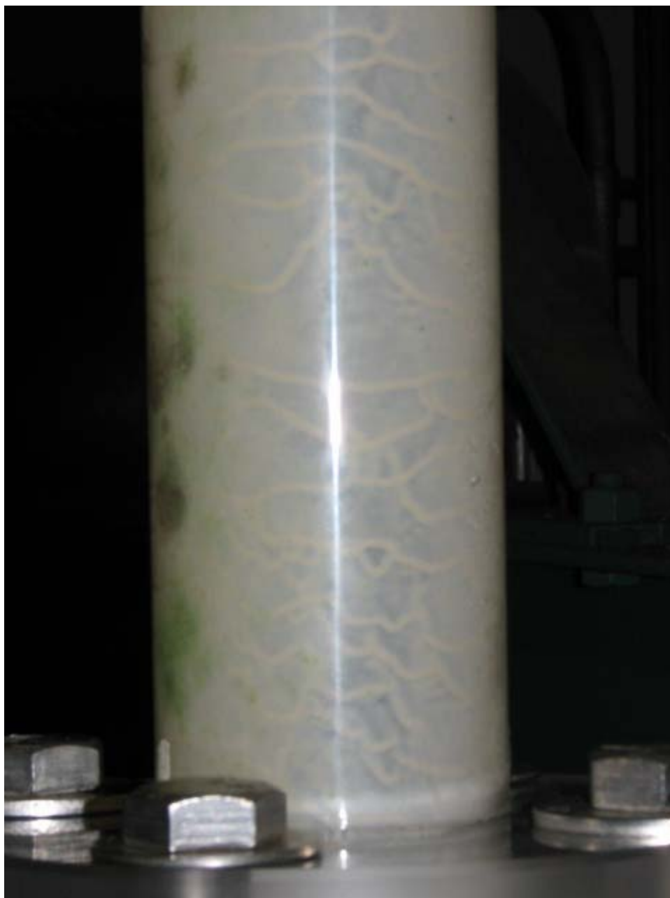
Figure 13. Simulant Surface Coating During a Drive Phase