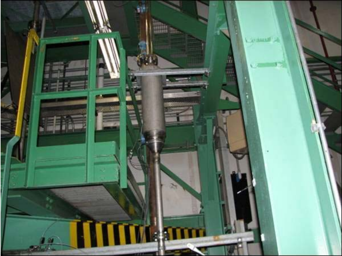
Figure 6. Photograph of Test Section showing 8" Dome used for Tests 14 & 15