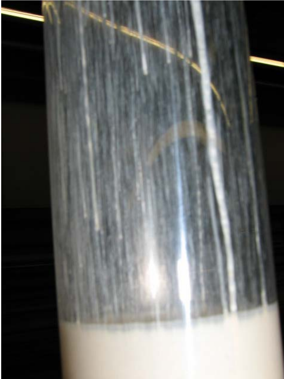
Figure 12. Simulant Fill Line and Streaks During Test 12 after 10 Cycles

Figure 14 shows surface film behavior under vent phase.