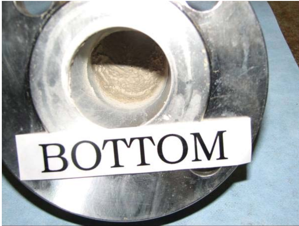
Figure 8. Kaolin/clay Buildup in the First Elbow in the Test Section during Test 10