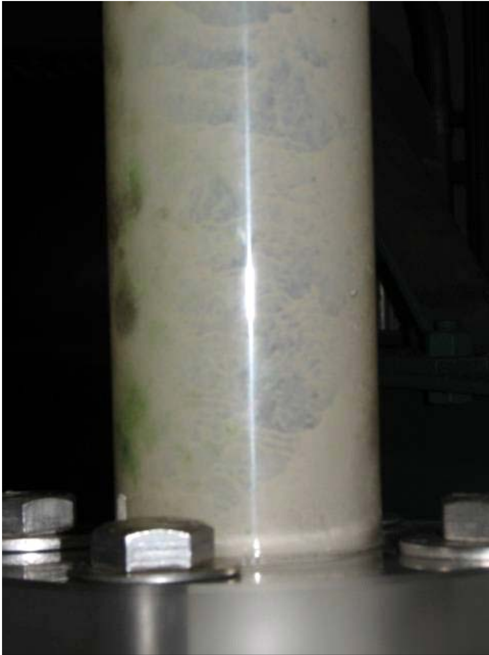
Figure 14. Simulant Surface Film Behavior under Vent Phase for Test 12