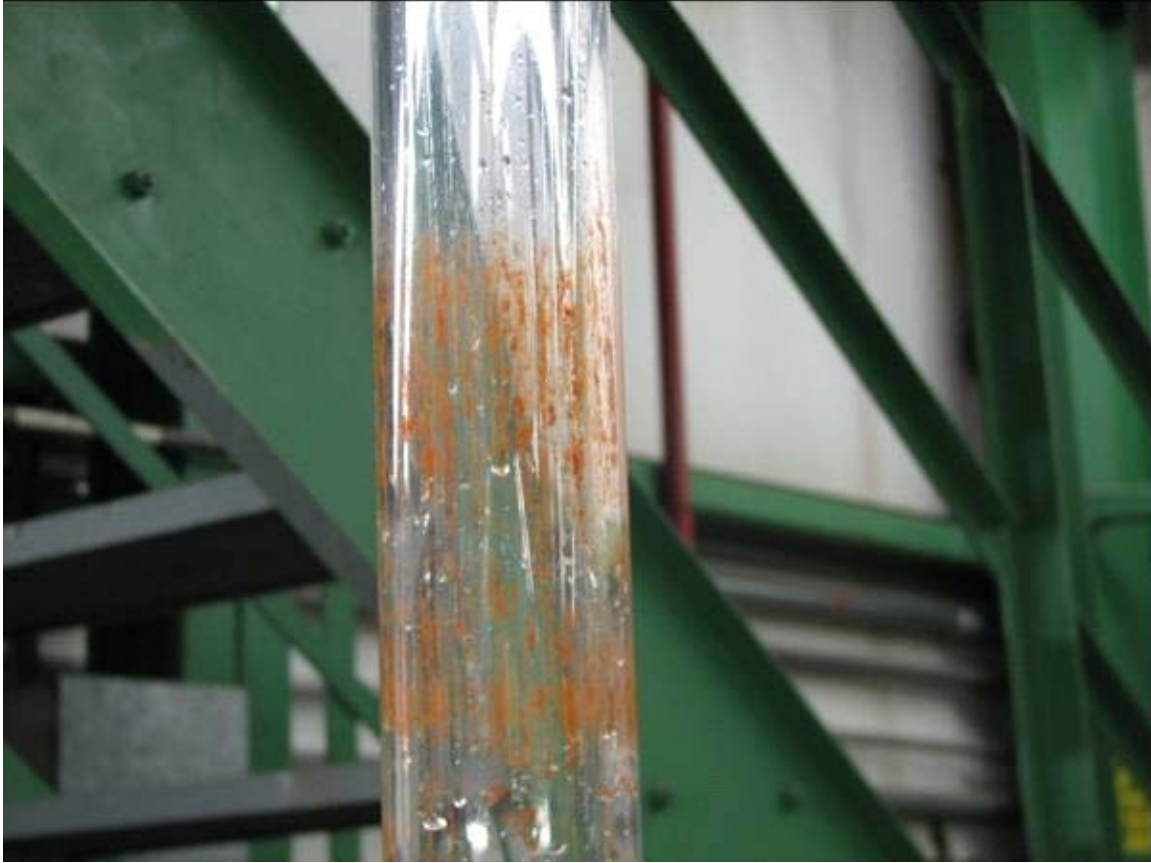
Figure 23. Test Section After 2 Wash Cycles

Figure 23 shows the same section after two wash cycles. Note that except for the fill line area, the remaining test section fairly clean.