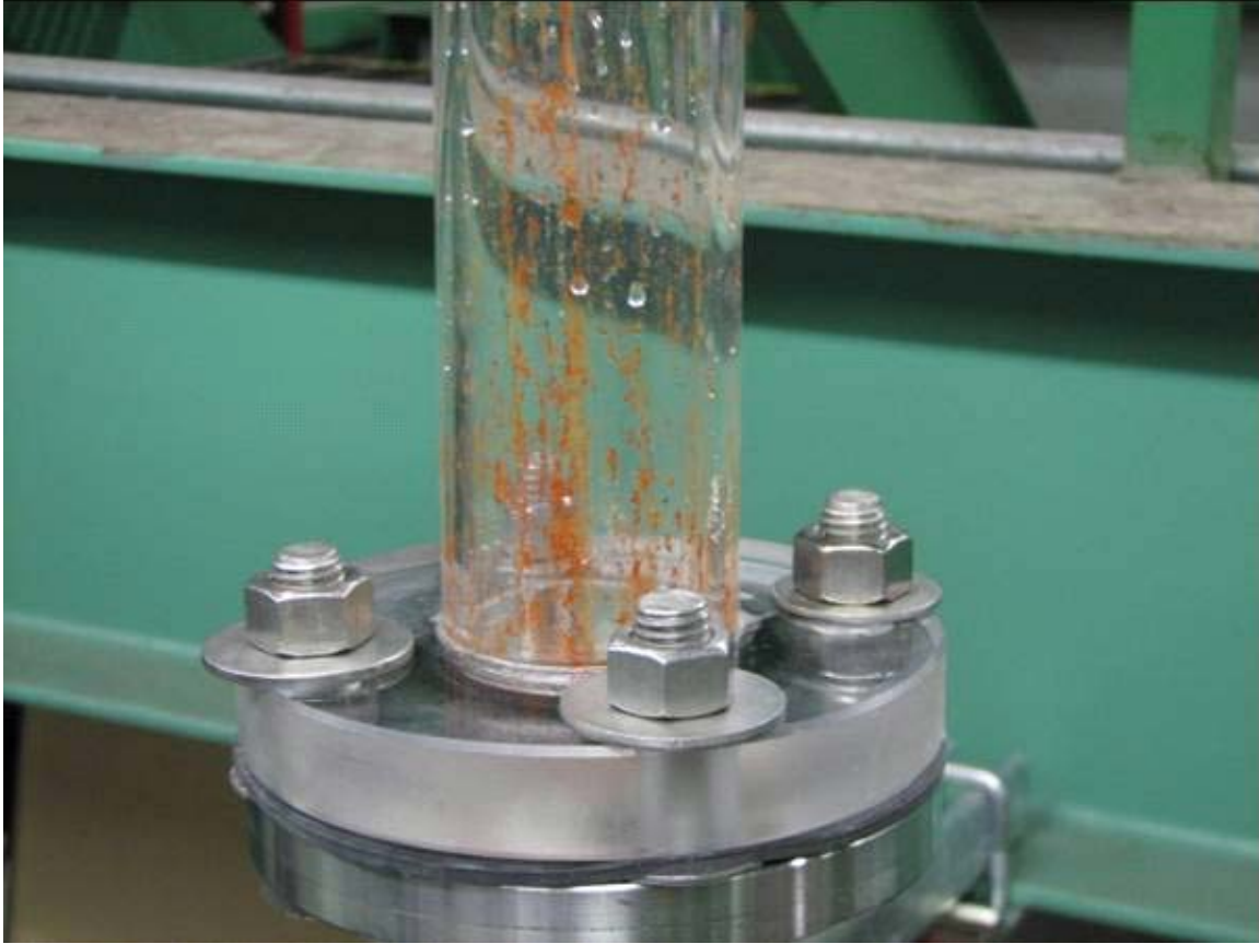
Figure 24. Test Section Near the Dome After 2 Wash Cycles

Figure 24 shows the same test section near its connection to the dome. It shows that two wash cycles are effective in cleaning out most of the test section.