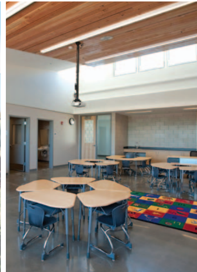
Classroom daylighting can positively impact students' health and development.

Many of the efficiency measures used in the school were based on recommendations in the Advanced Energy Design Guide for K-12 School Buildings , an energy efficiency guide developed by DOE and NREL in collaboration with national professional societies.