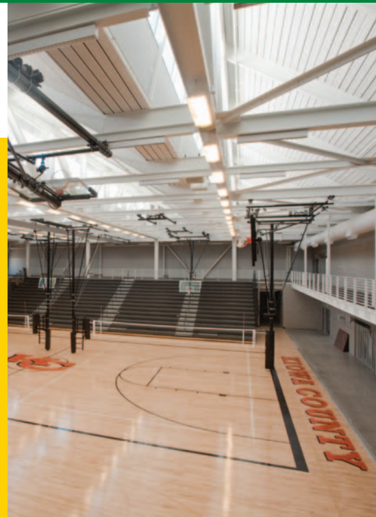
The school's gym is fully daylit to reduce artificial lighting and energy costs.