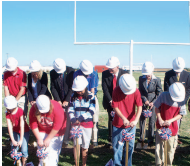
Students and community leaders broke ground on the new school in October 2008.