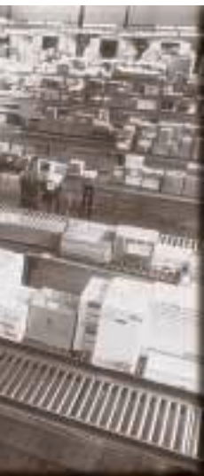
United Parcel Service/PIX 09807