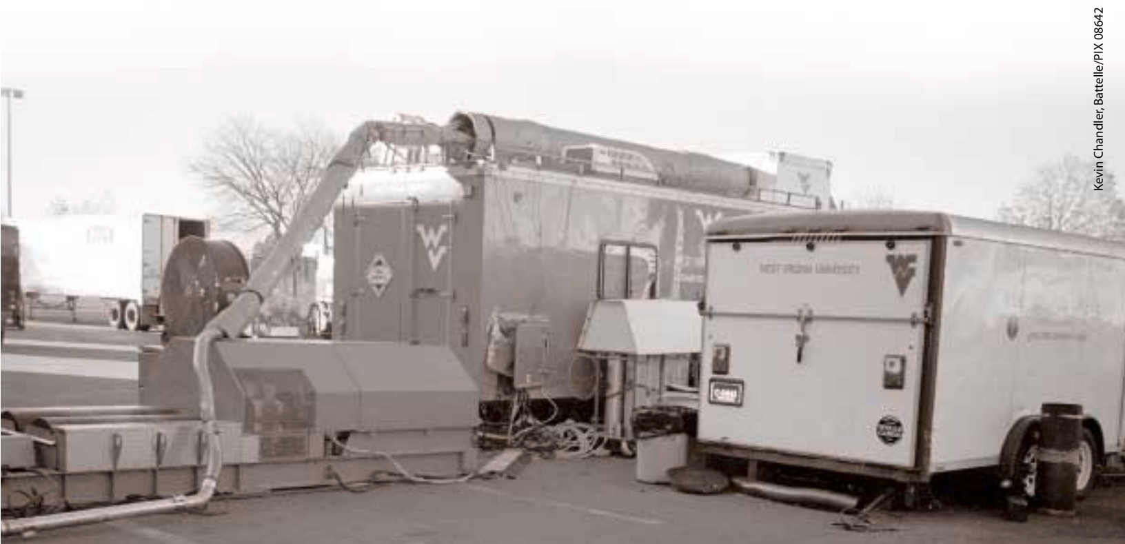
West Virginia University's transportable heavy-duty vehicle emissions testing laboratory collected data from the UPS test fleet in Hartford and Waterbury.

uses low-sulfur diesel fuel (ARCO ECD™) and particulate filters manufactured by Johnson Matthey and Engelhard.