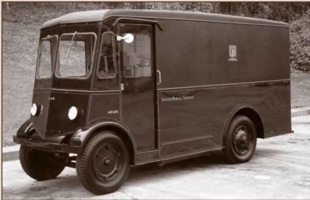
United Parcel Service/PIX 09806

This 1935 Walker truck—powered by electricity—was UPS's first alternative fuel package delivery vehicle.