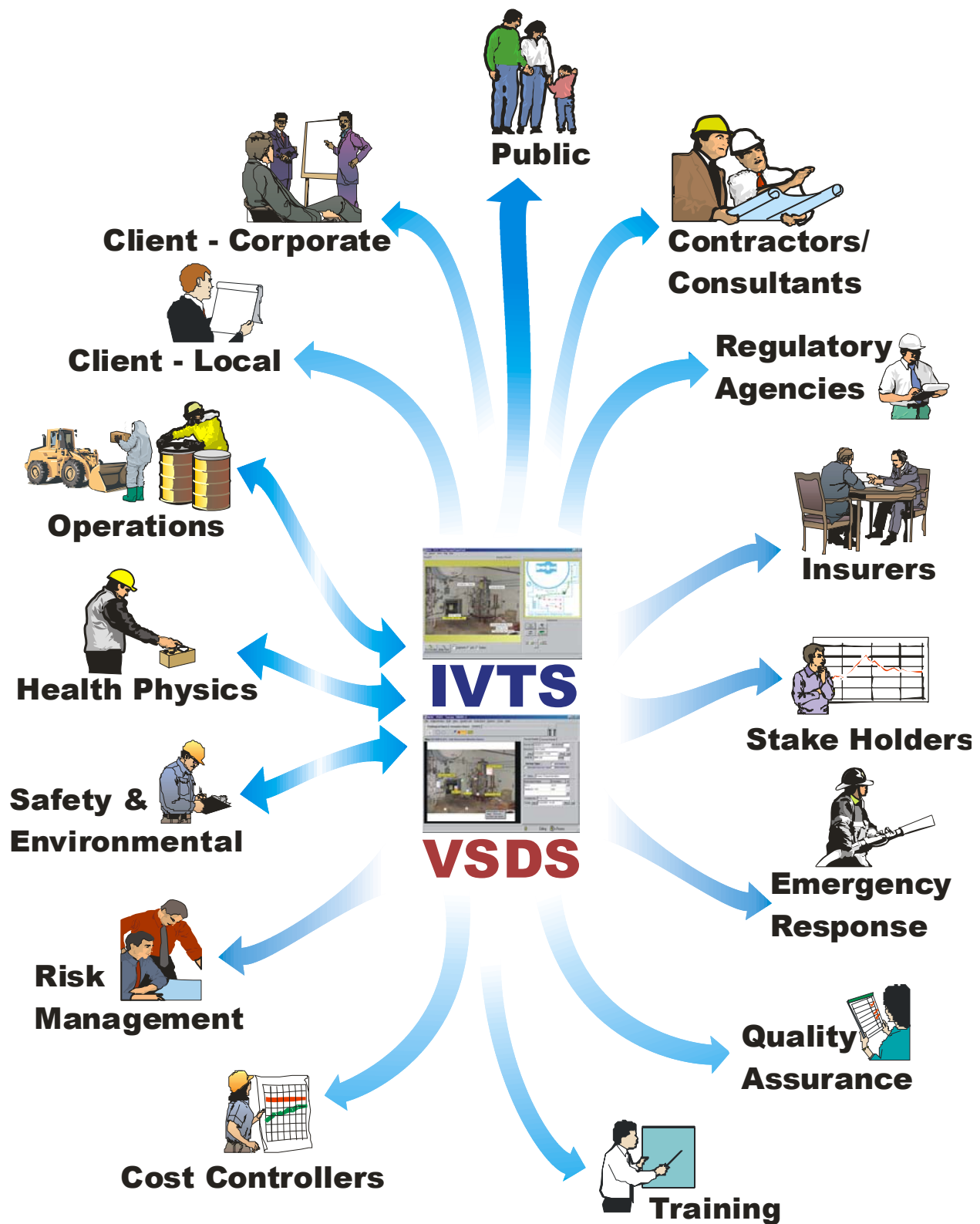
Fig. 3 Data Management and Communication with IVTS and VSDS