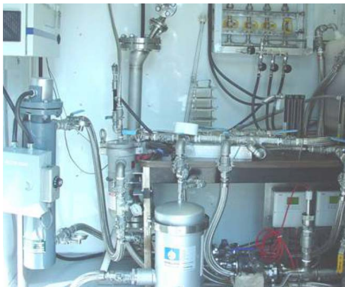
Fig. 4. Decomposition demonstration loop.

After the dissolution loop was operated for at least 4 hours, cross-flow was initiated between the dissolution and decomposition loops, and the UV source was activated. Decomposition of oxalate, as well as iron concentrations and pH, were monitored from sampling ports at the inlet to the UV treatment module and at the outlet where the UV-irradiated solution is recirculated to the dissolution loop. Metallic precipitates in the decomposition loop were collected on an in-line one-micron filter (cyclone or centrifuge separators will be used for the actual full scale application to the SRS HLW tanks). Aluminum and iron concentrations could be reduced to below detectable levels in the decomposition loop (due to precipitation on the filter) when the oxalic acid concentration was decomposed to less than 100 ppm. These results demonstrated that the dissolution process had met the key performance indicator of decomposition of greater than 90% of the oxalic acid.