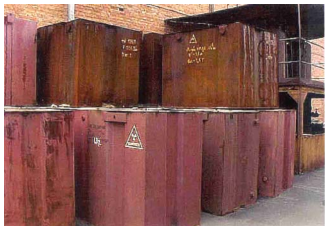
Figure 1. Metal boxes with radioactive waste.

The generation rate of SRW has been estimated to be about 1000 cubic meters per year (3,4) and could increase if the rate of submarine dismantlement increases. Existing storage containers and facilities are full and/or deteriorating. New waste is continuing to be generated and stored in an open-air environment, as shown in Figure 1. This waste will require stabilization. It is estimated that 25 to 30 percent of the SRW is presently uncovered and exposed to the elements. Much of this waste has not been well characterized, however, it is believed that from a third to a half of the waste is metallic. The metallic waste consists of equipment, piping, fittings, previously used containers, and other metal scraps.