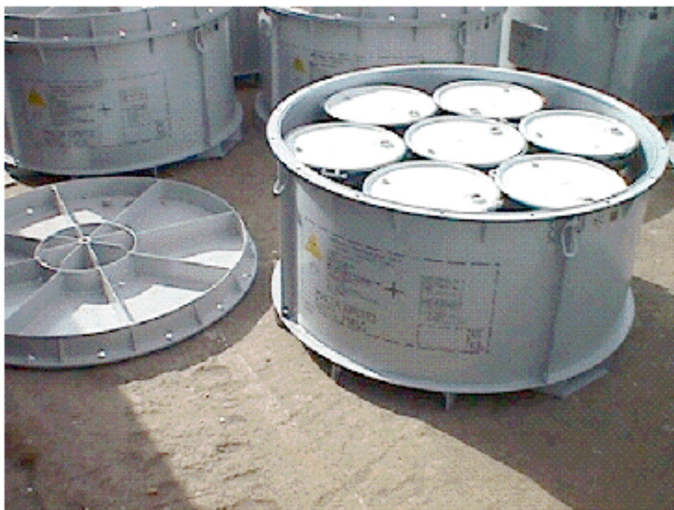
Figure 2. PST1A-6 Container with Seven Standard 200-liter Drums

Development of the PST1A-6 container has helped to create a self-sustaining waste management infrastructure in Russia, featuring safe and secure waste transport and storage. The container is in compliance with the requirements of Russian as well as IAEA international standards for safe transportation and storage of solid radioactive wastes. The Russian Navy has taken possession of the first 400 containers. Some wastes can be packed into drums, which are then loaded into the PST1A-6 containers, and some wastes can be loaded directly into the containers. All 400 containers will be shipped from Severodvinsk to the Polyarninsky Shipyard near Murmansk in early 2003. These containers will provide safe, secure storage for roughly 1,000 cubic meters of solid waste in northwest Russia.