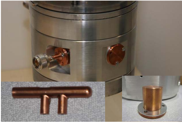
Figure 3. The prototype HOM coupler, with F-probe (inset left) and adjustable can lid (inset right).