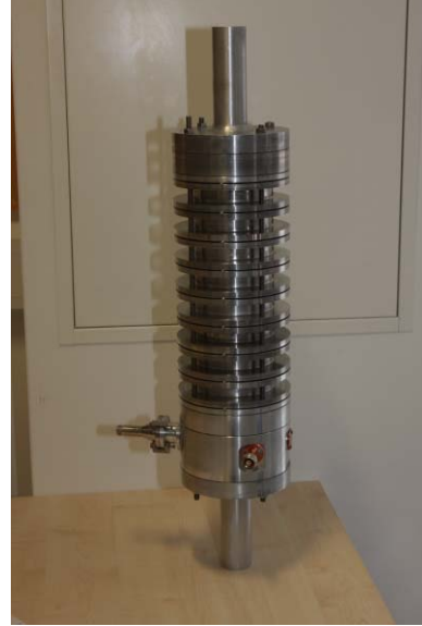
Figure 1. Aluminum prototype 9 cell crab cavity with HOM and power couplers.

The prototype, shown in Figure 1, allows the addition and removal of the couplers, and we constructed some of the possible coupler designs proposed for the ILC. The cavity was initially constructed to be azimuthally symmetric; however a series of metal disks could be bolted to the equator of the cavity polarizing the cavity by splitting the two dipole polarizations by 12 MHz.