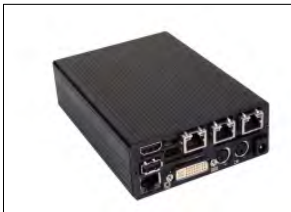
Figure 1. Stealth 1402 LPC

An affordable device is necessary if the devices are to be deployed en masse. A small form factor is desired to limit the impact to server environments. Lastly, a device that can be weatherized will allow deployment location flexibility. Initially, sufficient CPU capacity is necessary to keep up with aggregated network packet capture in real time. In the future, additional CPU capacity is desired to provide resources to conduct edge analytics and support automated decisions and actions. The 1402 LPC from Stealth (Figures 1 and 2) meets all of these requirements.