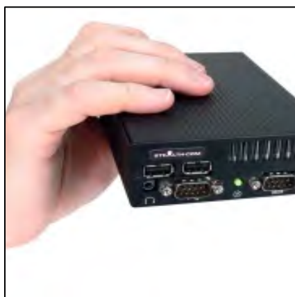
Figure 2. Stealth 1402 LPC