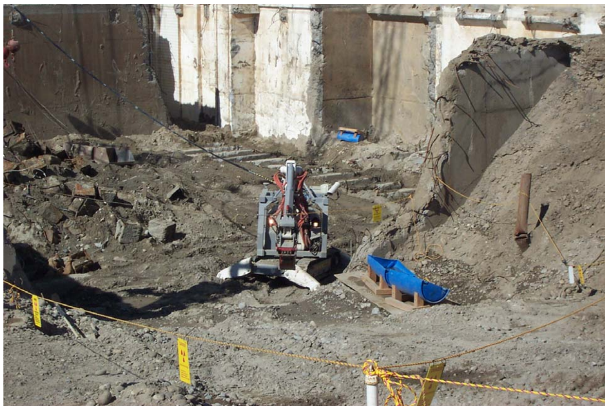
Fig. 3. BROKK 330N in the FSB.

Hot spot excavation for retrieval of the suspect SNF piece is performed in a very controlled manner with a BROKK 330N remotely operated excavator. Careful excavation of an identified hot spot is performed to determine the cause of the high radiation levels. As each bucket of sludge, debris, and fill material is placed in a skiff box, an RO7 ion chamber probe, operated from a man lift 7.6 m (25 ft) above, is used to determine if and where the hot material was in the deposited material. When an area in the skiff box is identified as containing radioactive material, the BROKK bucket is used to slowly uncover the item of concern (see Figure 3). Manned entries into the area with long-handled rakes have at times been needed to uncover an item. When located, the item is visually inspected using BROKK cameras or binoculars to determine if the item looks like fuel. Highly irradiated traveling wire flux monitor wire, fuel spacers, and process tubes are eliminated from further SNF consideration at this point. If the item looks like fuel, or the visual determination is inconclusive, a shielded URSA 2x2 sodium iodide probe is used to determine the relative cesium-137 ratio to other radionuclides as the final step in determining if the item is suspect SNF versus an irradiated piece of metal. Upon determination, the item is placed in a water-filled holding container until final SNF determination is made and shipment to K Basins is warranted.