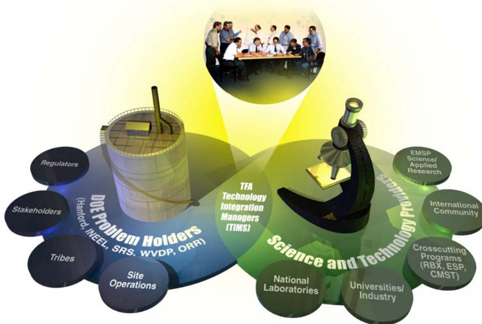
Fig. 1. TFA Integrates Science and Technology Providers and DOE Problem Holders.

To accomplish this, TFA plans and manages an S&T development program of approximately $65 million per year to address needs that the sites have identified to accomplish their clean up missions. TFA interfaces with S&T providers across the country, indeed around the world, to bring S&T to the sites to use to solve their problems. Use is the key concept in the vision, and a fundamental aspiration embedded in the program vernacular --the sites are users .