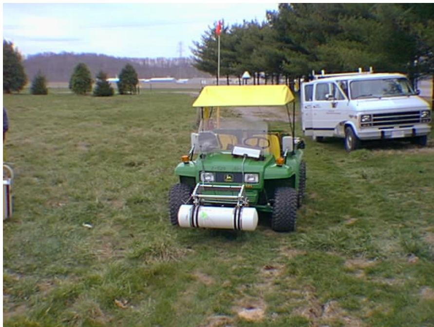
Figure 2. The Gator real-time system.

The INL provided integrated engineering computer hardware and software support to greatly streamline the data acquisition and analysis process to the point where activity and coverage maps were available to the field technicians in near real time. The characterization system developed for the FCP was designed to operate from multiple platforms. The original platform used as the FCP was deployed from a large tractor-based vehicle called the Radiation Tracking System (RTRAK). The RTRAK provided the delivery or deployment system, but the acquisition and analysis hardware and software were designed and implemented by the INL. This acquisition and analysis system was deployed from five additional vehicles, which included four hand-pushed deployments dubbed the Radiation Scanning System (RSS) and an ATV-based system called the Gator, shown in Figure 2. The RTRAK was eventually retired towards the end of the FCP closure activities. Functionally, the RTRAK, RSS, and Gator platforms were identical and simply represented three different methods for mobile-deployment of the detectors and the real-time software analysis system.