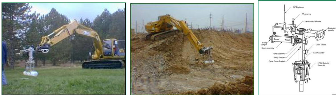
Figure 3. EMS NaI platform is used to survey trenches.

Real-time gamma measurements can be made in several modes including stationary measurements at a prescribed detector height or offset, and mobile scanning measurements can be made with either detector at a prescribed detector height and scanning speed. Either gross activity or spectrometric measurements can be collected in any of these modes. All stationary or mobile measurements are tagged with the detector location. The movement of the EMS-mounted detector over the survey area is tracked using either GPS or a laser-based tracking system that traces detector location on display screens in the excavator cab and in the support van.