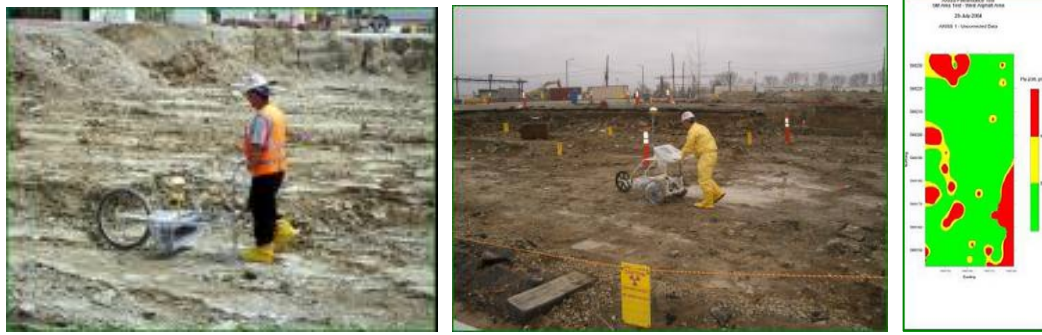
Figure 4. AXISS performing survey and a contour plot of Building-38 survey performed by the AXISS at the MCP in 2004.

The AXISS was used at the MCP to quantify Plutonium-238 concentrations in the field. These in situ measurements are used to establish that cleanup and hot-spot levels for Plutonium-238 have been achieved (i.e., 55 pCi/g and 165 pCi/g, respectively, at MCP). The AXISS provides the ability to rapidly cover 100% of the desired survey area. Collected information is instantly available via the system's real-time data system, and display of field data is available for remedial decision-making. The AXISS possesses protocols for routine system operation that include source checks, energy calibration, efficiency calibration, and background measurements. Automated Quality Assurance/Quality Control (QA/QC) measures are integrated into the control software [3] to provide nearly error-free QA/QC and to provide automatic documentation that is used to validate decisions made to achieve cleanup goals. Automated features on the AXISS dramatically reduce labor requirements as well as errors due to factors associated with human nature, such as fatigue and repetitive activity.