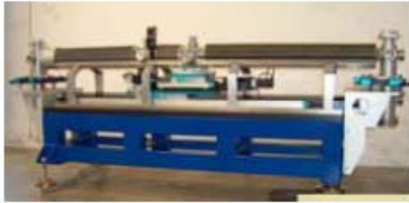
Figure 5: Emittance-meter device with long bellows.

order to conduct measurements of the rms normalized transverse emittance as a function of the drift length. This measurements will be performed at the beginning of next year running the beam at the RF-gun exit energy of 5.7 MeV, before installation of the 3 accelerating sections.