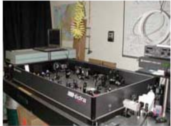
Figure 3: HIDRA-50 amplifier for the SPARC laser.

conducted next month at LNF. The HIDRA-50 amplifier system, made of one regenerative and two multi-pass amplifiers, has already reached the specs in the infra-red, delivering 50 mJ of output pulse energy with 104 fs pulses and good beam quality ( M_x^2=1.9 and M_y^2=1.6 ). Preliminary tests in the UV (266 nm), performed after the third harmonic crystal and the UV stretcher, showed the capability to reach 1.8 mJ of pulse energy with quite good pulse-to-pulse stability, i.e. less than 4.5%, and a fairly good beam quality, i.e. M_x^2=2.7 and M_y^2=1.9 . These tests will be further completed at LNF soon.