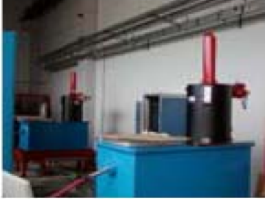
Figure 2: SPARC klystrons with oil tanks installed in the SPARC building (upper facility room or klystron hall).

The modulator power test, scheduled at the end of this month, will be performed initially with the klystron operating in diode-mode. The installation of waveguide distribution network and RF devices (circulators, shifters, etc.) will begin next month.