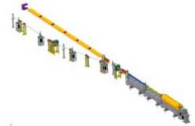
Figure 1: Layout of SPARC photo-injector, with RF-gun, 3 S-band accelerating sections and FEL undulator (6 modules). Beam line for undulator by-pass is also shown.

advanced experiments in the production, characterization and control of high brightness electron beams, as those required by X-ray FEL's and advanced high gradient acceleration techniques (plasma, IFEL, etc.).