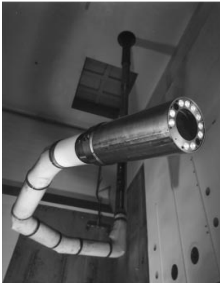
Figure 1. The Stereo Viewing System end effector uses video cameras that enable close up inspection of tank structures.

Figure 1 shows the Stereo Viewing System (also known as the high-resolution stereo video system end effector) designed to provide close up inspection of internal tank structures. Stereoscopic viewing enables operators to evaluate the depth of pits, seams, and other anomalies in the tank. It is one of various tools, deployed by the Light Duty Utility Arm (LDUA) called "end effectors." It is specifically designed for remote operation in underground hazardous waste storage tanks.