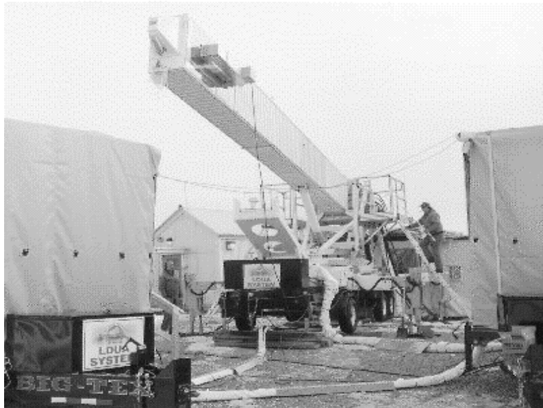
Figure 3. The Light Duty Utility Arm deployed various end effectors into tank WM-188 at the INEEL tank farm to take interior video and collect waste samples.

The Stereo Viewing System was the first end effector deployed into the tank, followed by an NDE end effector for weld defect and corrosion inspection. End effectors were exchanged using a remotely operated system. Following the inspections, a sampling end effector was used to obtain three heel samples from different locations on the tank floor. The heel samples confirmed historical data presently used to estimate chemical and corrosive characteristics of the tank heel and to support grout formulations for eventual closure of the tank. Use of the LDUA and end effectors will continue through 2012 at INEEL to sample and inspect other tanks.