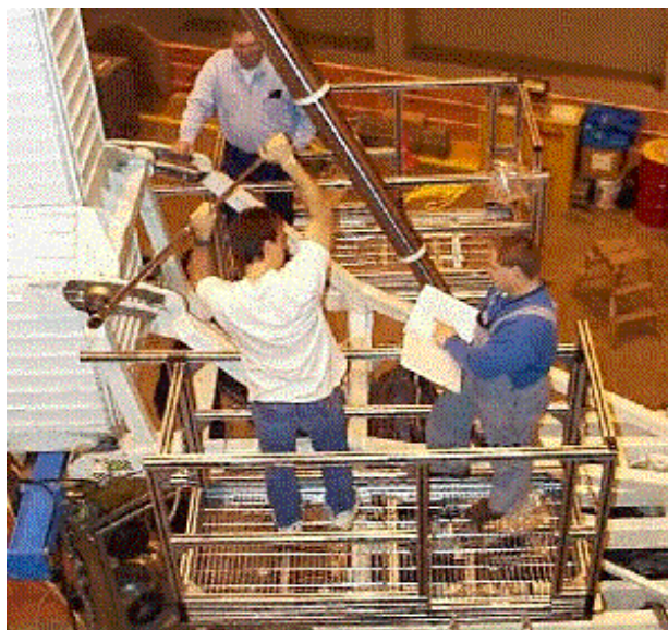
Figure 2. System operators trained using the LDUA in a cold-test facility prior to deploying it into underground storage tank

This system's remote operation reduces direct contact with the tank and its contents. The risk from the decontamination water is negligible, as are any other risks associated with this technology. Some tasks, such as end effector exchange, require operator activities above the tank, but do not pose significant risks to workers.