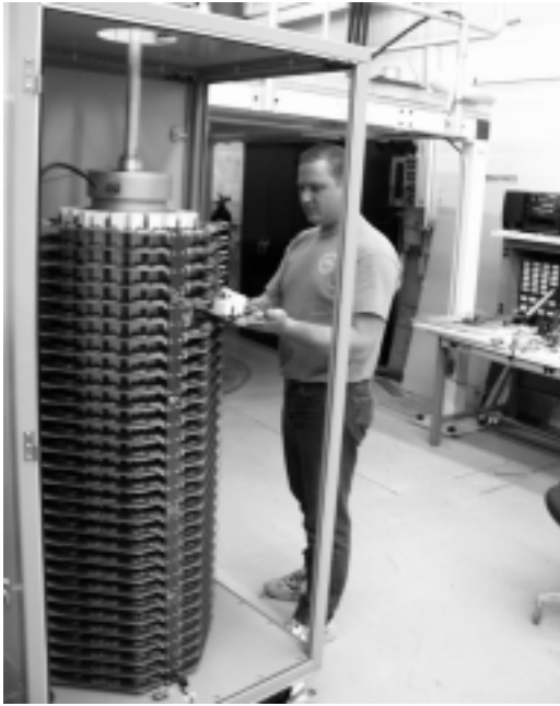
Figure 4. 20-kV kicker modulator under test

The modulator for the 50-GeV ring-extraction kicker, because of the requirement for multiple pulses at arbitrary times (together with relatively short rise and fall times), is by far the most technically challenging of the modulators. Work on the first stage of the extraction-kicker modulator was started in early 2001 at Lawrence Livermore National Lab. The design is based on an inductive voltage adder topology at 50 kV using 800 V power MOSFETs as the switching elements. Rise and fall times in the 10 – 20 ns range have been demonstrated at 20 kV on a similar unit shown undergoing testing in Fig. 4.