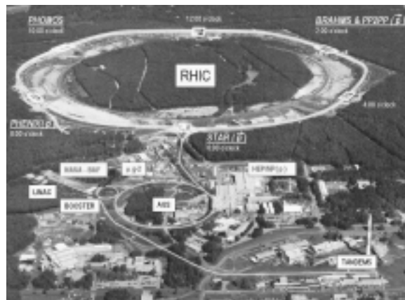
Figure 1. Collider-Accelerator complex at BNL

A picture of the Collider-Accelerator Complex, illustrating the location of the Alternating Gradient Synchrotron (AGS) at BNL, is shown in Fig. 1.