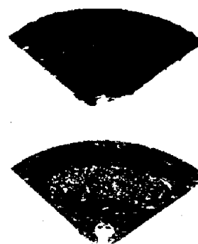
Figure 2. Photograph of ^{76}\text{Ge} target wheel quadrants before and after bombardment by 5 pA 314 MeV ^{80}\text{Se} beam showing damage due to recrystallization in the target.

In conclusion, the preparation of isotopic germanium target wheels for GAMMASPHERE proved crucial to the success of the experiment. A double stack of 300-400 \mu\text{g}/\text{cm}^2 ^{76}\text{Ge} foils, prepared for a rotating target wheel, provided sufficient ^{151,152}\text{Dy} reactions for the experiment and withstood 314 MeV ^{80}\text{Se} beam currents of 5 pA for six days of running. Examination of the target wheels after irradiation revealed severe damage due to re-crystallization within the foil, particularly for the front foil stack, facing the beam. The re-crystallization temperature for germanium occurs somewhere between 90° and 454° C which would indicate that the target was exposed to a deposited beam power greater than that calculated. This suggests that the focused beam spot may be smaller than expected. A photograph is given in Figure 2 showing target quadrants before and after bombardment by the heavy ion beam.