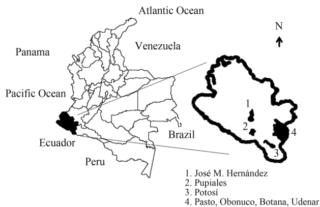
Figure 1 - Geographical location of the Nariño department in Colombia.

Allele frequency, expected ( H_e ) and observed ( H_o ) heterozygosity, as well as estimated unbiased diversity for all the loci in the different lines and populations, were obtained through TFPGA software (Miller et al. , 1997). Based on sample size, FSTAT software (Goudet, 2001) was used for calculating allelic richness. Polymorphic information content (PIC) (Botstein et al. , 1980) was estimated with Cervus software (Marshall et al. , 1998). By means of the Raymond and Rousset (1995) method, an exact test was carried out to establish deviations from Hardy-Weinberg equilibrium.