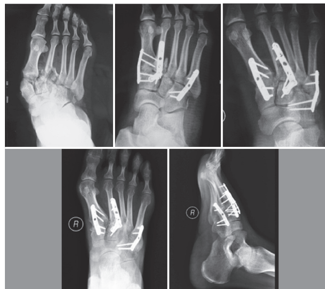
Figure 3. Case 1: Female 38 year as old Myerson I type, X-radiograph before operation; X-radiograph shows the fracture-dislocation healed two weeks and six months post-operation.