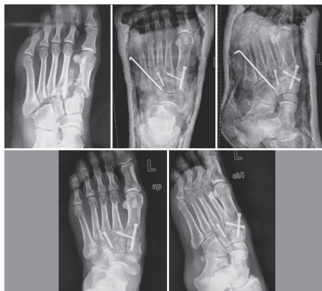
Figure 4. Case 2: Male 40 years old, Myerson IIB type, X-radiograph before operation; X-radiograph shows the fracture-dislocation healed two weeks and six months post-operation.

with degenerative joint disease in different levels after removal of the inner plant (25.0%, 8/32). In group 2, radiographic analysis revealed anatomic reduction in twenty-three patients and non-anatomic reduction in five patients (82.1%, 23/28); six patients had spontaneous TMT joints fusion, and two patients had severe discomfort and pain. There were thirteen patients with degenerative joint disease in different levels after removal of the inner plant (46.4%, 13/28). One patient had one of transarticular screws broken but the injury healed anatomically at last and he had mild pain after prolonged walking. Two patients had undergone a tarsometatarsal arthrodesis while in group 2 there were three patients.