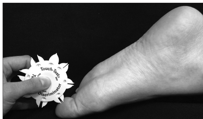
Figure 1. Two-point discrimination test.

Figure 2 shows the variation of the TPD test for each group.