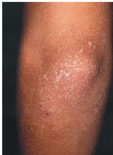
FIGURE 1: Keratotic papules on elbow

After the diagnosis of epidermodysplasia verruciformis, treatment was initiated with salicylic acid, retinoic acid, photoprotection, levamisol and Thuya CH30, with no improvement. Because of the exten-