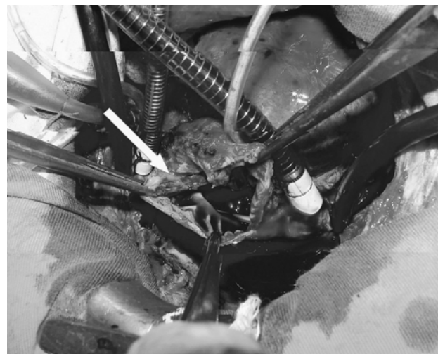
Fig. 2 – intra-atrial foreign body (arrow)