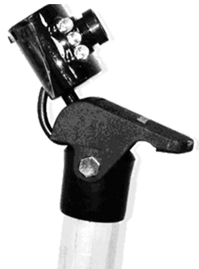
FIGURE 4 - Support and webcam

The camera is a webcam attached to a 3 mm aluminum cable coated with a transparent hose allowing the necessary grip when in contact with the "mini chrome jet" (Figure 4).