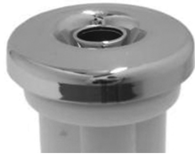
FIGURE 2 - Mini chromed jet

the operating instruments (which involves the simultaneous training of two students), and also allows the individual training because when you release the camera the device is stabilized in the same location.