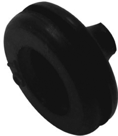
FIGURE 3 - Rubber thread passer

To simulate the adhesion of the skin with the instruments, rather than the traditional trocar used in the procedures, "rubber thread passer" should be attached (Figure 3), which allows mobility while providing a similar resistance to human skin.