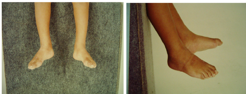
Fig. 3 – Same patient as in Fig. 1, after the operation on the stiff clubfoot consisting of PMLR + talectomy.