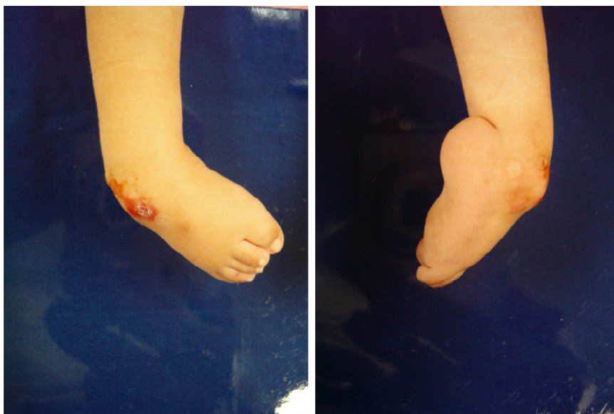
Fig. 2 – Patient with the ability to walk within the community, with myelodysplastic clubfoot with a lesion in the dorsolateral skin (the weight-bearing area of this foot).

of the midfoot and forefoot. Therefore, it does not provide full correction of the deformities and increases the possibility of recurrence.