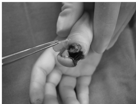
Fig. 3 – Nail bed injury.