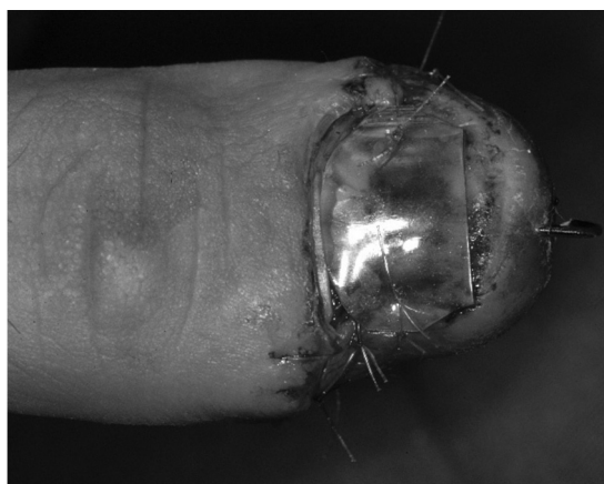
Fig. 8 – Silicone lamina.

Sex and age did not have any influence on the results obtained. There was a direct relationship between the injury mechanism, type of treatment used, time when treatment was performed and the esthetic and functional results obtained in