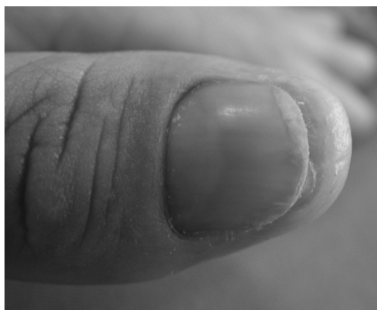
Fig. 9 – Final result.

this study. For the results to be better assessed, we developed a table of scores that included three factors (Table 1).