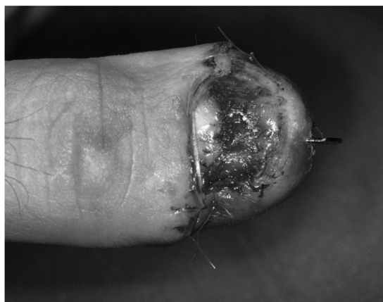
Fig. 7 – Repair of the nail bed.

The nail bed suturing was done using polyglactin 6.0 thread. When available, the traumatized nails were always reconditioned and were placed under the proximal fold of the nail and eponychium. This policy enabled better alignment of the nail bed suture and greater comfort for patients at the time of applying dressings. When the original nail was not available, a plate of synthetic material was improvised from a small piece of flexible silicone that was taken from the saline solution bags that are available in any surgical facility. Provisional immobilization was used for two weeks. In cases of fracturing of the distal phalanx, two crossed Kirschner wires and a volar Zimmer splint were used until radiological consolidation had been achieved (mean of six weeks). The donor zone for the nail bed graft was always the nail bed of the hallux (Figs. 6–9).