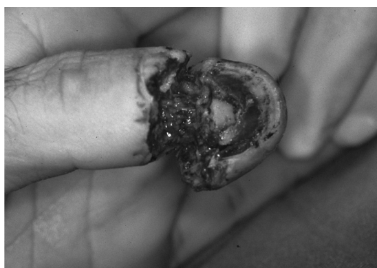
Fig. 6 – Trauma of the nail complex.