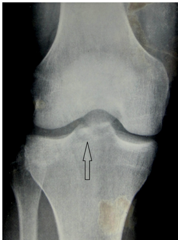
Fig. 2 – Lateral radiograph of the knee (arrow).

II for the avulsion of the posterior cruciate ligament. Because of the magnitude of the fragment displacement (the posterior fragment extended to the tibial plateau) and the time that had elapsed since the trauma, it was decided to perform open reduction of both avulsions.