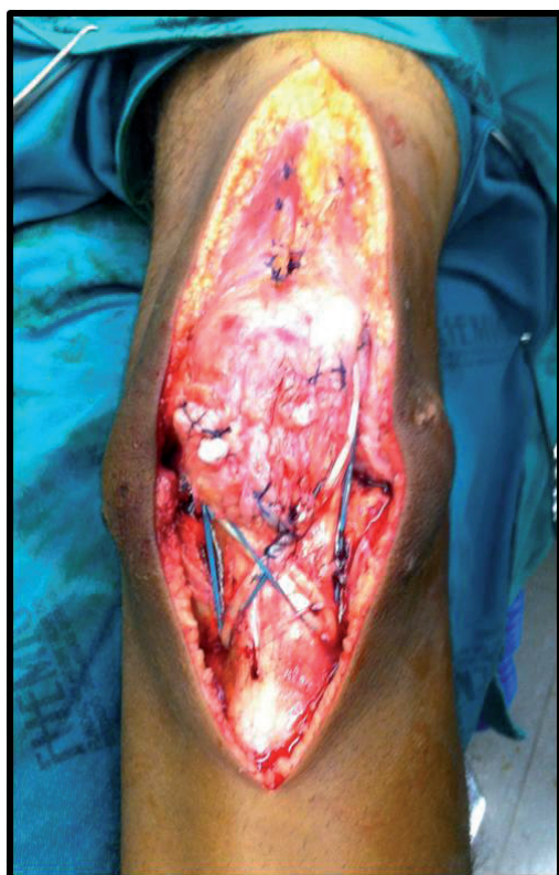
Fig. 5 - Final aspect of reconstruction.