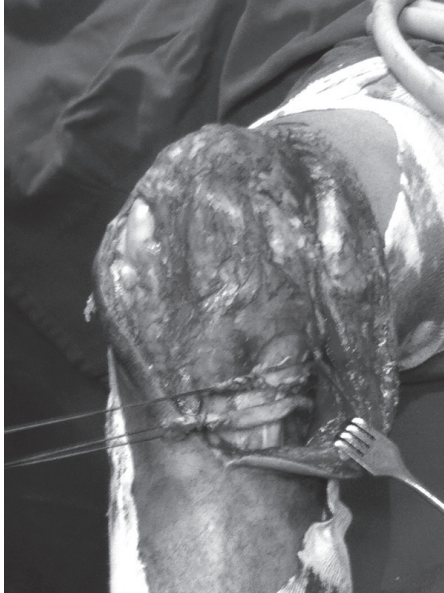
Fig. 1 - Ample anterior incision showing the semitendinosus and gracilis tendons repaired.

Patients begin to do isometric exercises on the second day after surgery and start to use crutches. Flexion begins at the end of the first week through exercises with the heel on the floor. Extension exercises begin on the 4th or 5th week and continue during the specialized rehabilitation. Immobilization is maintained for two to three weeks, and the splint is removed so that the patient can do the exercises.