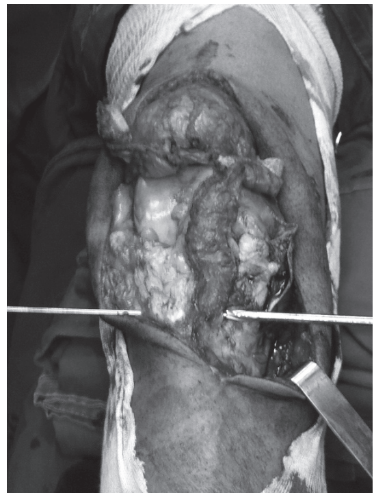
Fig. 3 - (A) Producing the patellar bone tunnel. (B) Producing the tibial bone tunnel.