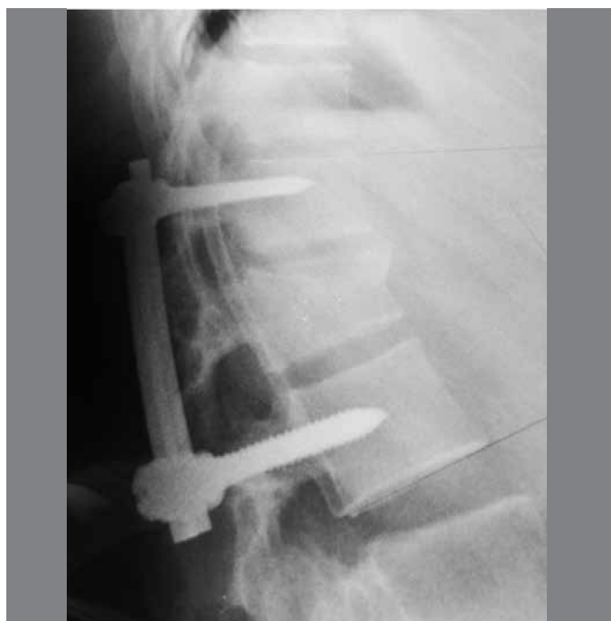
Figure 2 – Long-term postoperative result from thoracolumbar fracture, showing evolution with residual kyphosis.