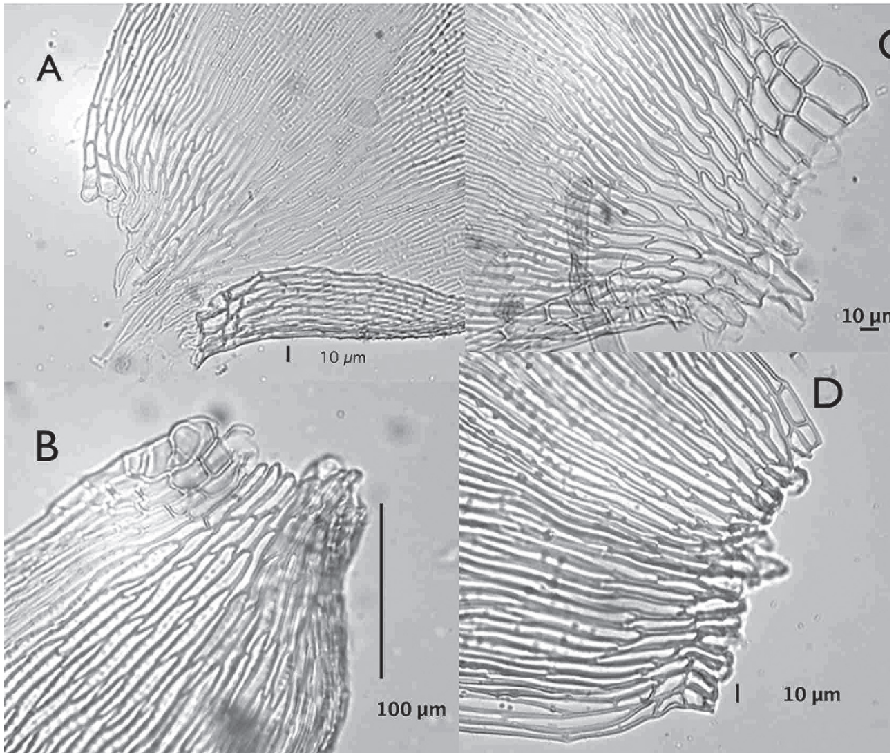
Figure 2. Differences among the alar region in the three species of Taxithelium from Brazil. A- T. juruense , B and C- T. planum ; D- T. pluripunctatum .

Brazil and also Africa. It has been misreported from Asia because it resembles the Asian species Taxithelium nepalense (Schwägr.) Broth. As stated above it is a highly variable species; leaf shape variation can be seen in Fig.1A, B. Another useful character is its somewhat developed alar region when compared to the other two (Figure 2).