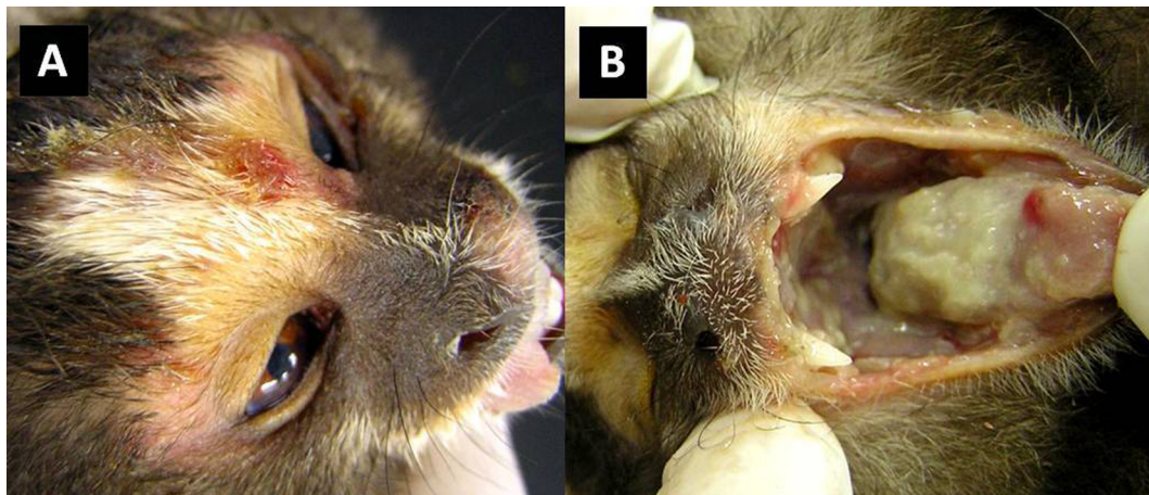
Fig.1. Fatal Human herpesvirus 1 (HHV-1) infection in marmosets. (A) The face has an ulcer covered with crusts. (B) Epithelium of the oral cavity and tongue is focally extensively ulcerated and covered with grey-whitish fibrinous plaques.

* Found dead; + clinical sign present; - clinical sign absent.