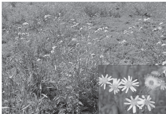
Fig.1. (A) Pre-calving area infested by fireweed ( Senecio madagascariensis ). Note also the invasion by the low, mat-forming Bindweed ( Soliva sp.). (B) Insert shows the yellow, daisy-like flowers (usually with 13 petals) and the white, slender, and light seeds of S. madagascariensis .